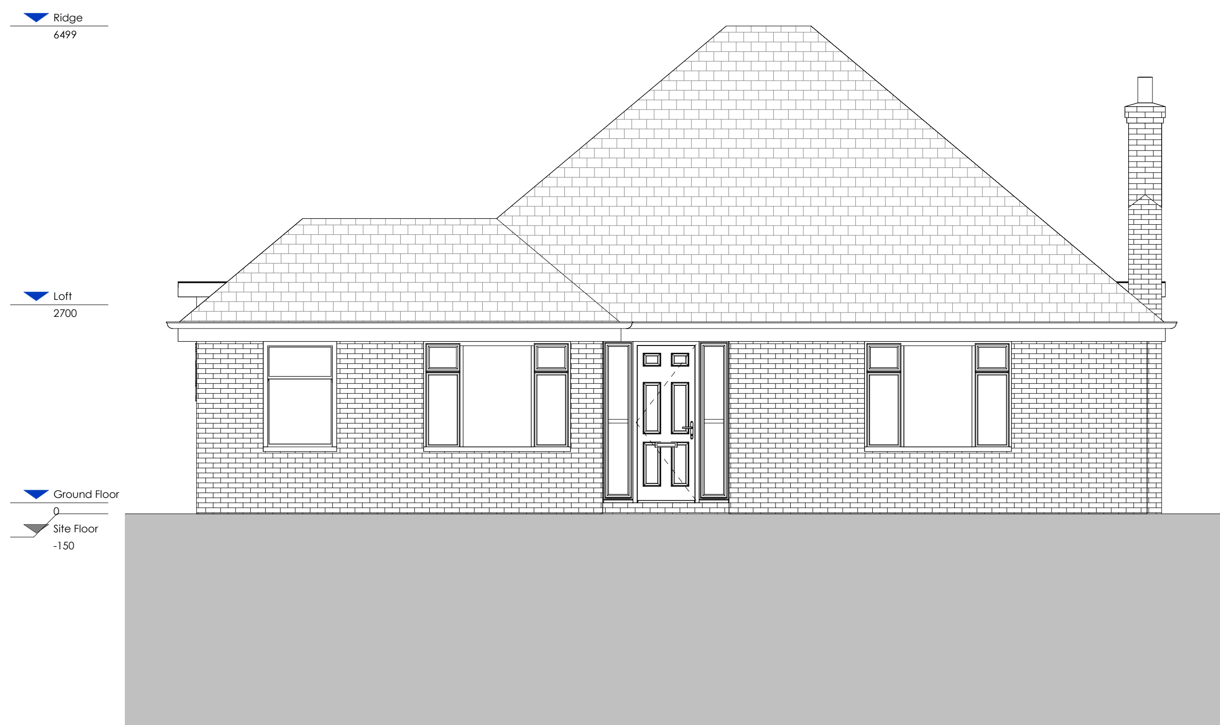
1. EXISTING FRONT ELEVATION 1 : 50