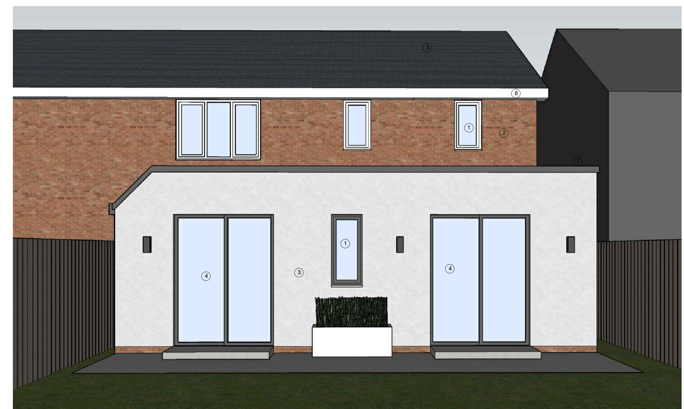
1 3D CGI PROPOSED REAR VIEW