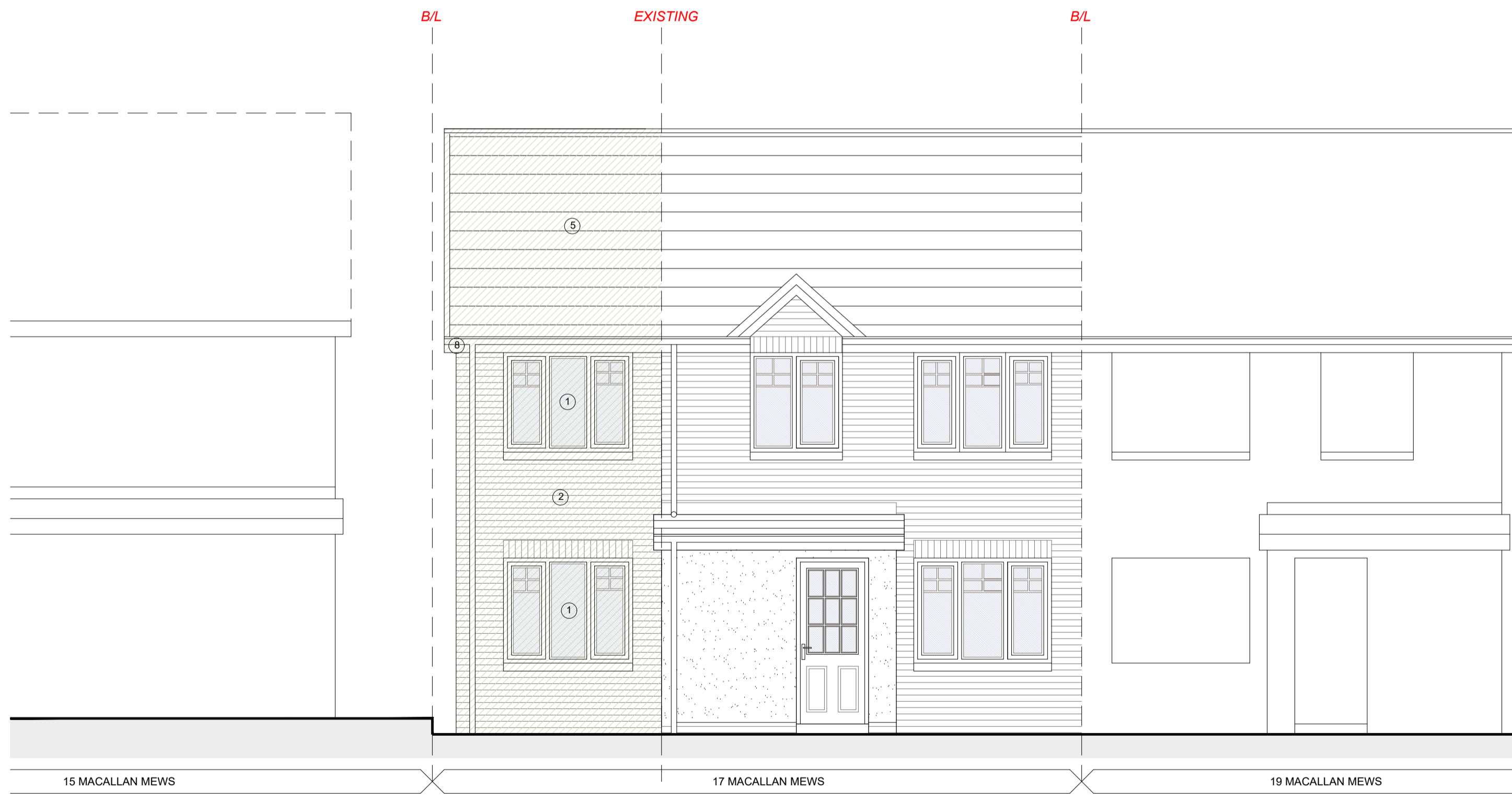
1 PROPOSED SOUTH ELEVATION