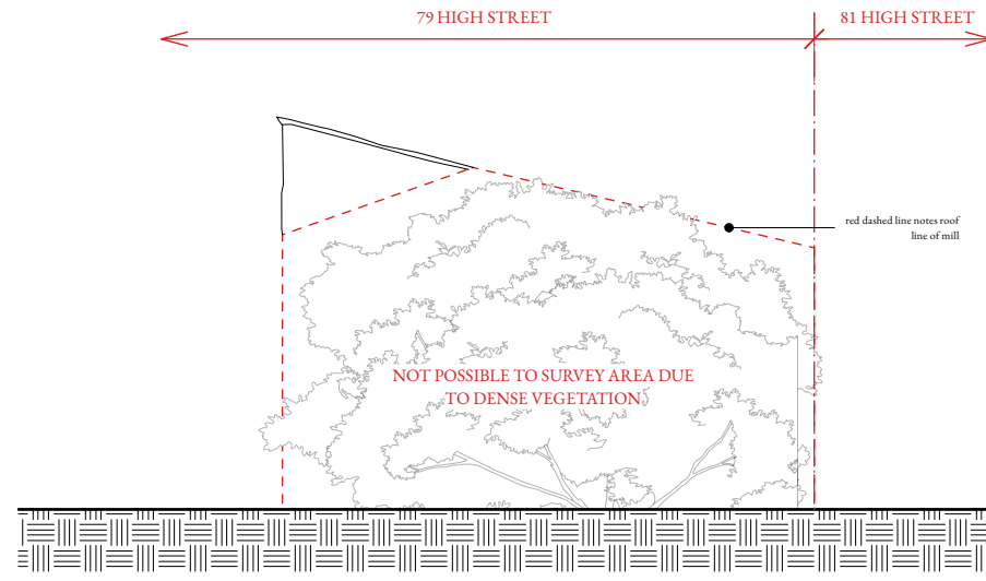
WEST ELEVATION Scale: 1:100