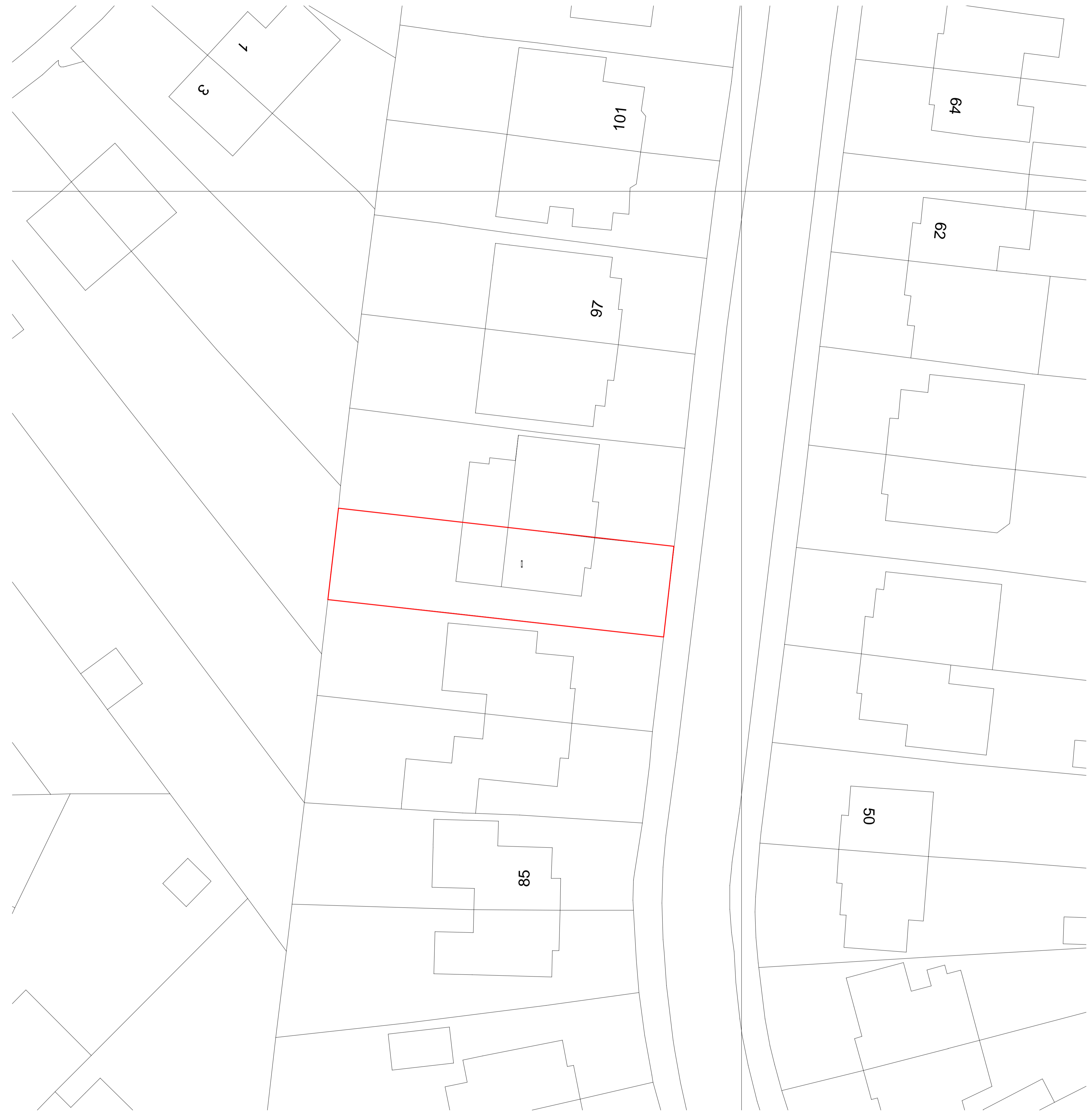
Existing Site Plan 1 : 200

Serial number: 279471 © Crown copyright and database right 2024 Ordnance Survey licence AC2000046263 Reproduction in whole or in part is prohibited without the prior permission of Ordnance Survey.