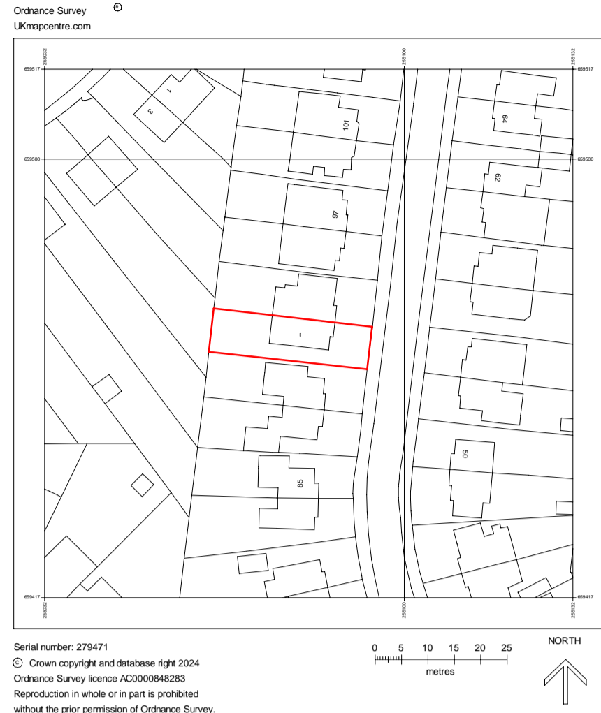
Location Plan 1 : 1000

Serial number: 279471 © Crown copyright and database right 2024 Ordnance Survey licence AC2000046263 Reproduction in whole or in part is prohibited without the prior permission of Ordnance Survey.