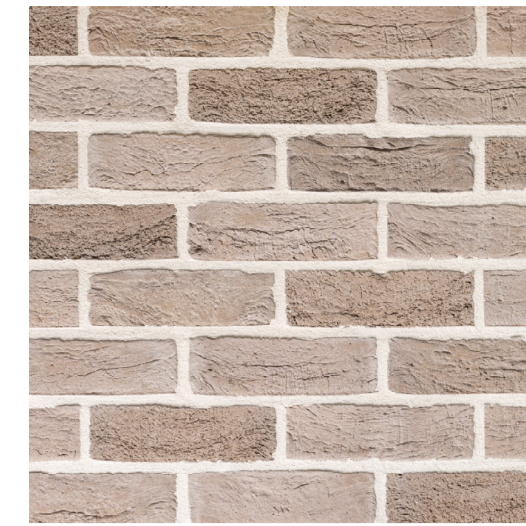
TRADITIONAL BRICK AND STONE 'NORMANDY GREY' FACING BRICK