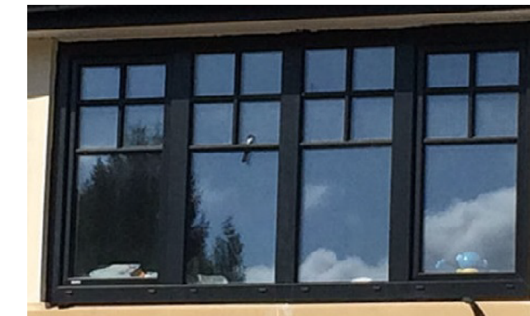
BLACK ALUMINIUM DOUBLE GLAZED WINDOWS