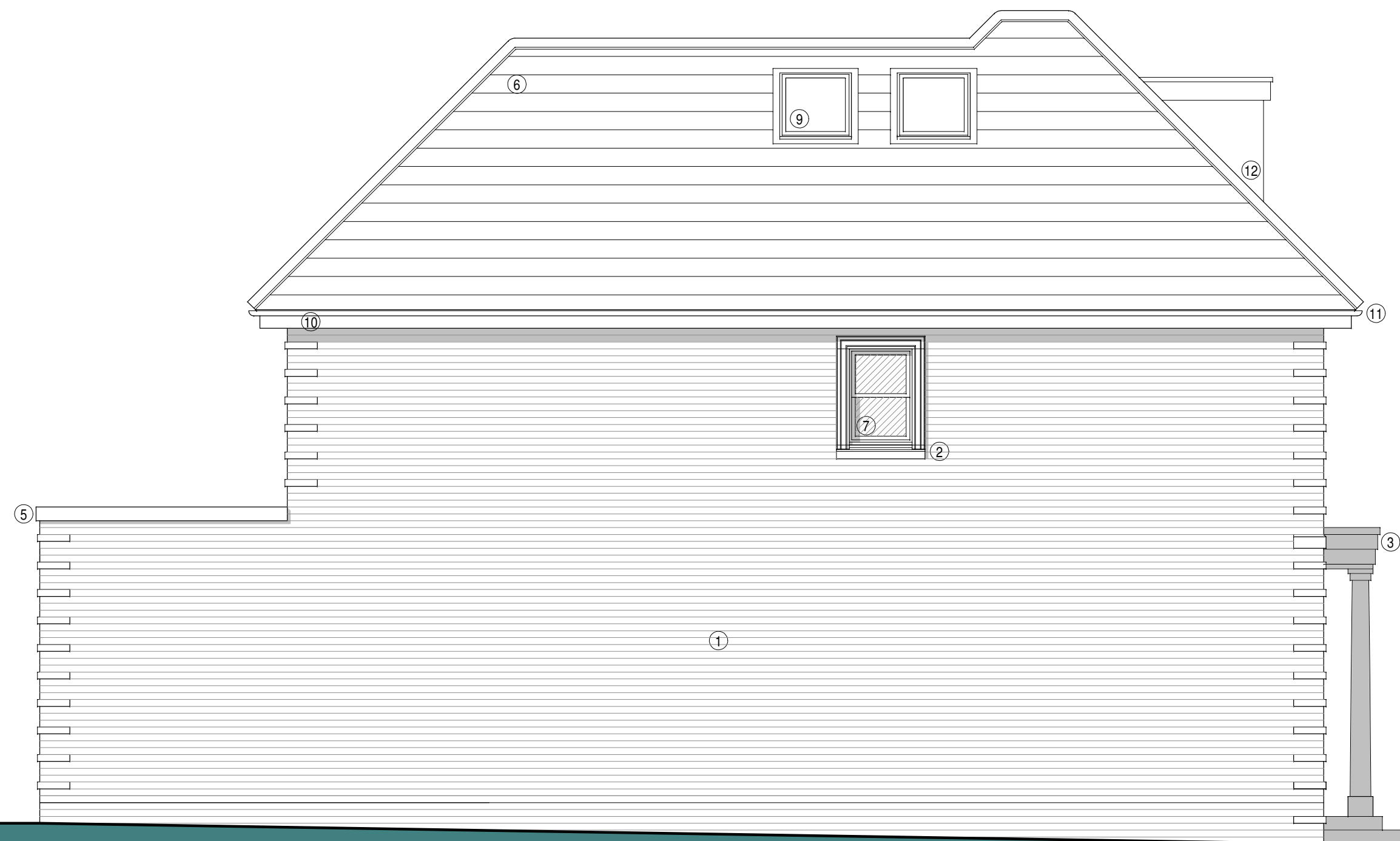
proposed side (south) elevation