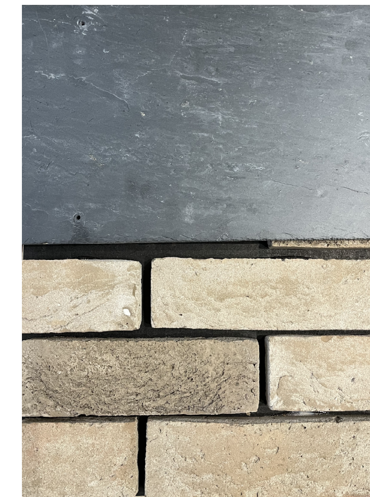
BRICK AND SLATE SAMPLES