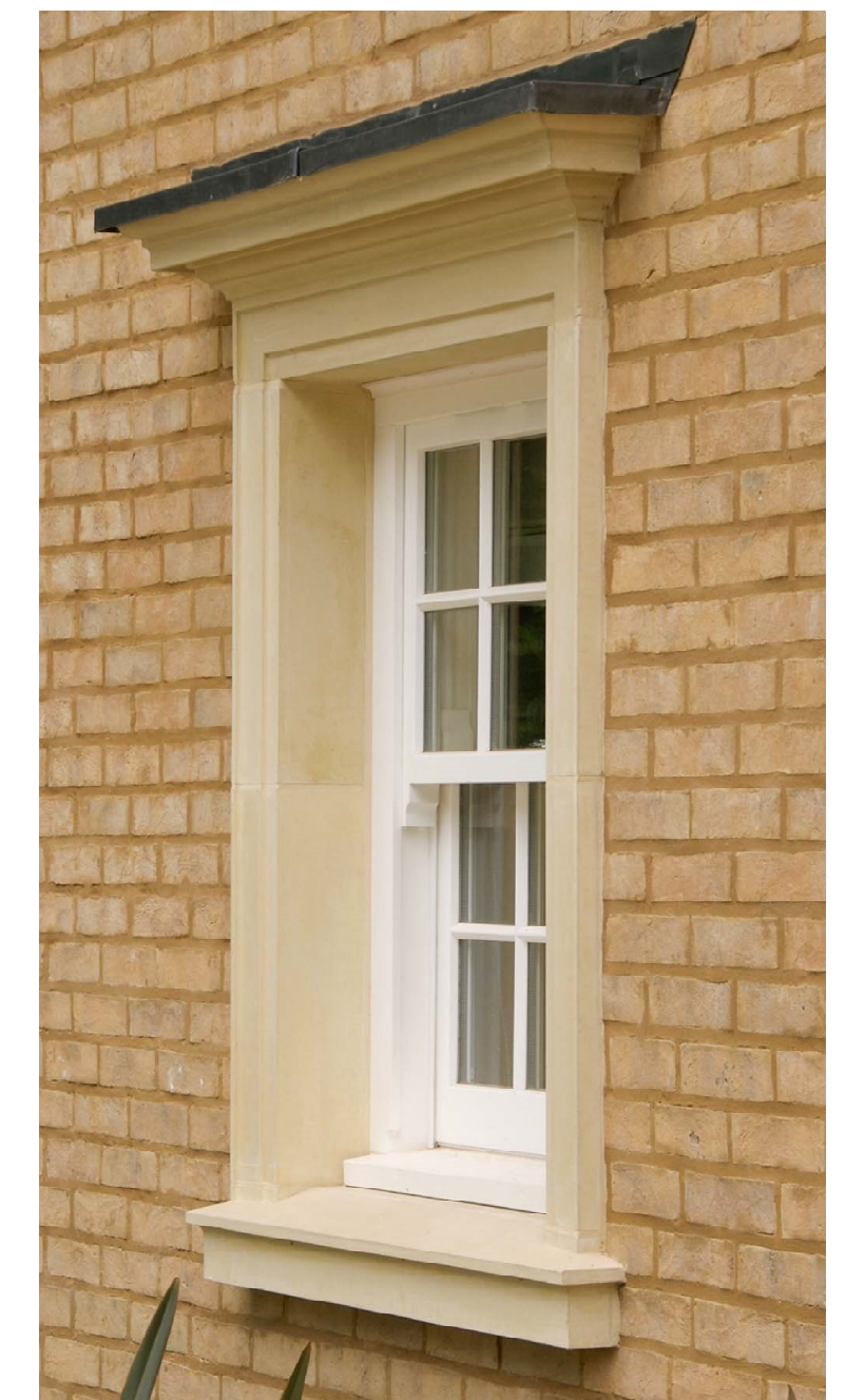
RECONSTITUTED STONE WINDOW SURROUNDS