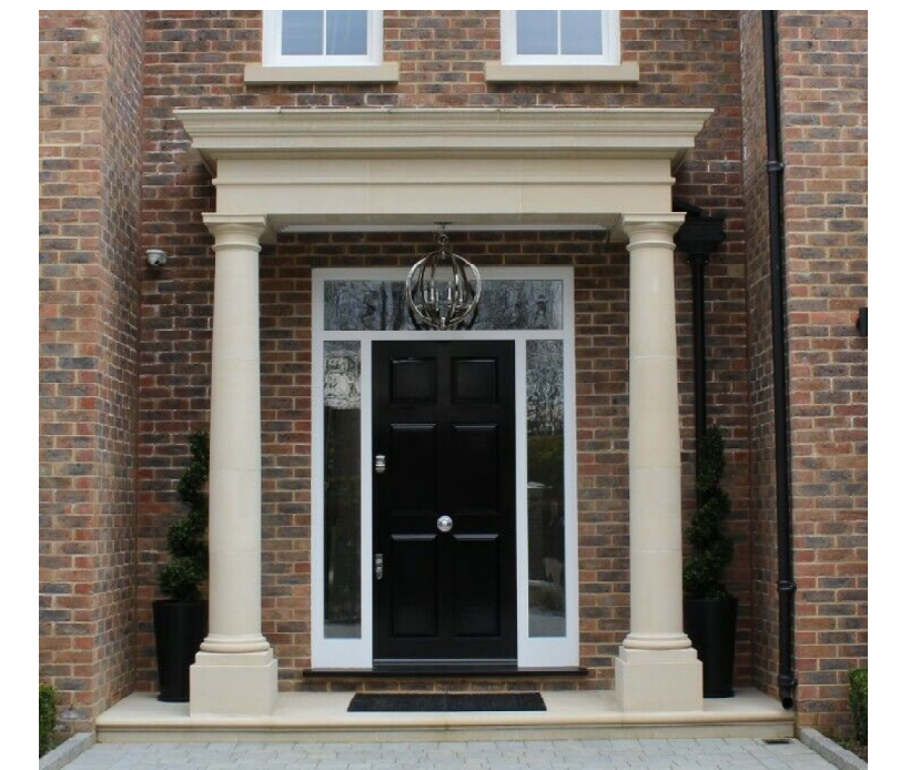
RECONSTITUTED STONE ENTRANCE PORTICO