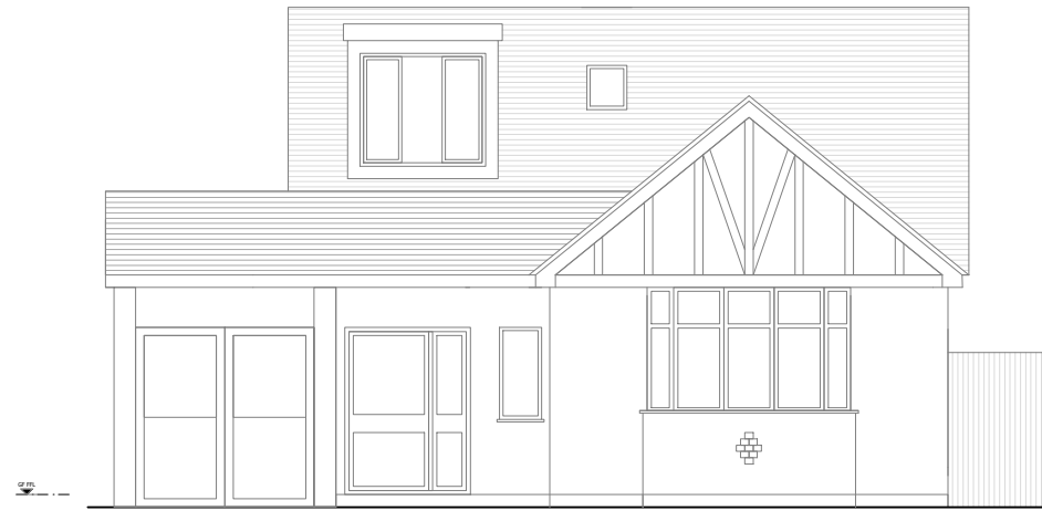
1 Front (No changes) Scale 1:100