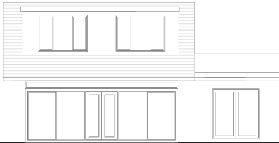
3 Rear Existing Scale 1:100