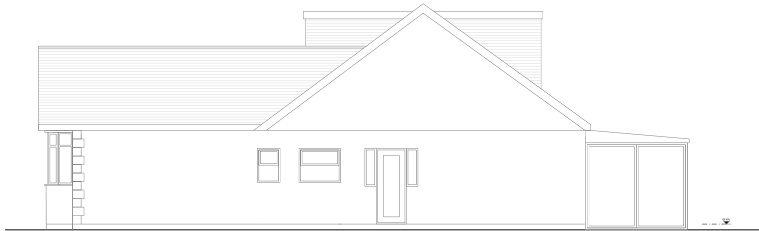
4 Side Existing Scale 1:100

These plans have been drawn for the purpose of planning permission and lawful consents.