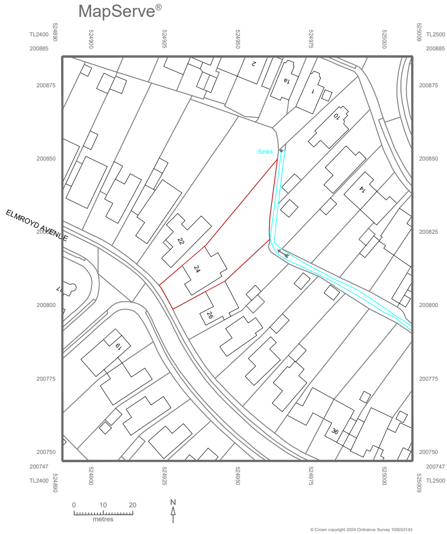
01 Existing Site Location Plan Scale 1:1250