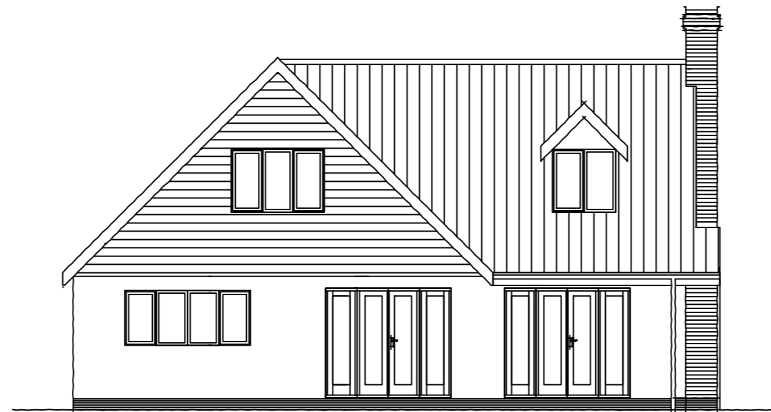
SOUTH/ WEST ELEVATION Scale 1:100