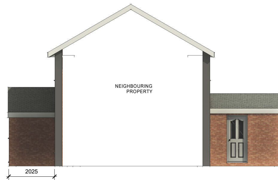
Side Elevation B