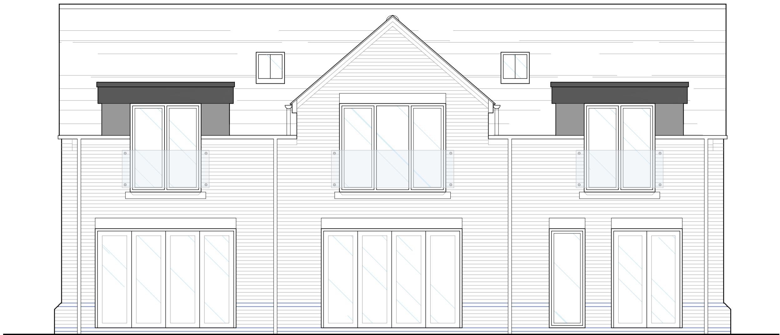
Rear Elevation – Scale 1:50