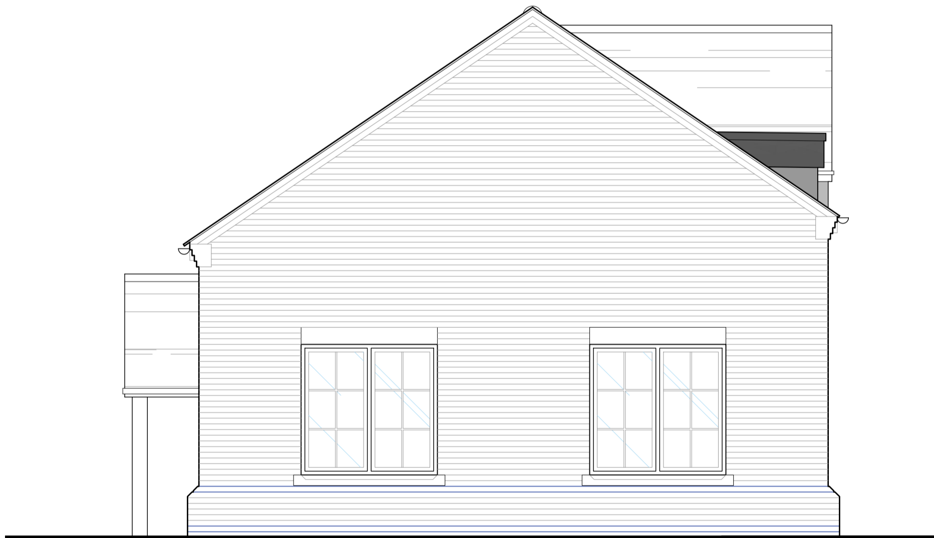
Side Elevation – Scale 1:50