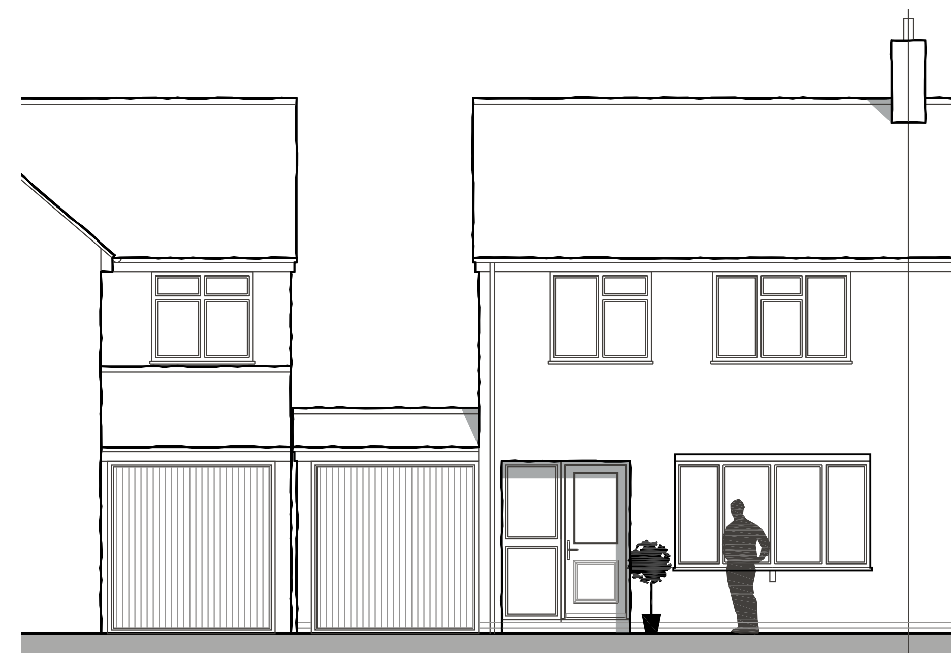
EXISTING FRONT ELEVATION scale 1:50