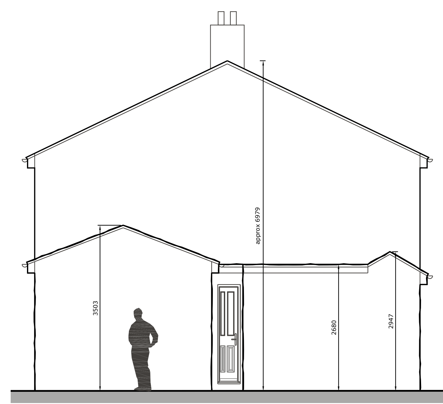
EXISTING SIDE ELEVATION scale 1:50