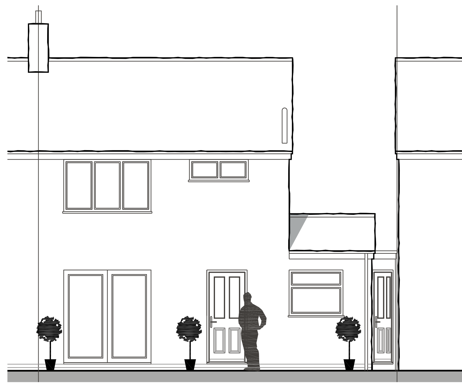
EXISTING REAR ELEVATION scale 1:50