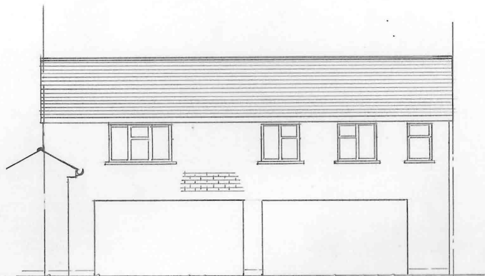
EXISTING FRONT ELEV / STREET SCENE