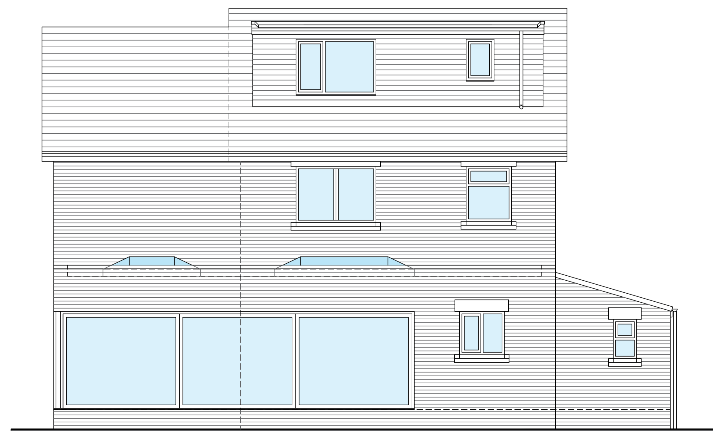
1:50 PROPOSED REAR ELEVATION To Rear Garden

2No. PRUNUS AVIUM (WILD CHERRY) TREES TO BE PLANTED ON COMPLETION OF WORKS