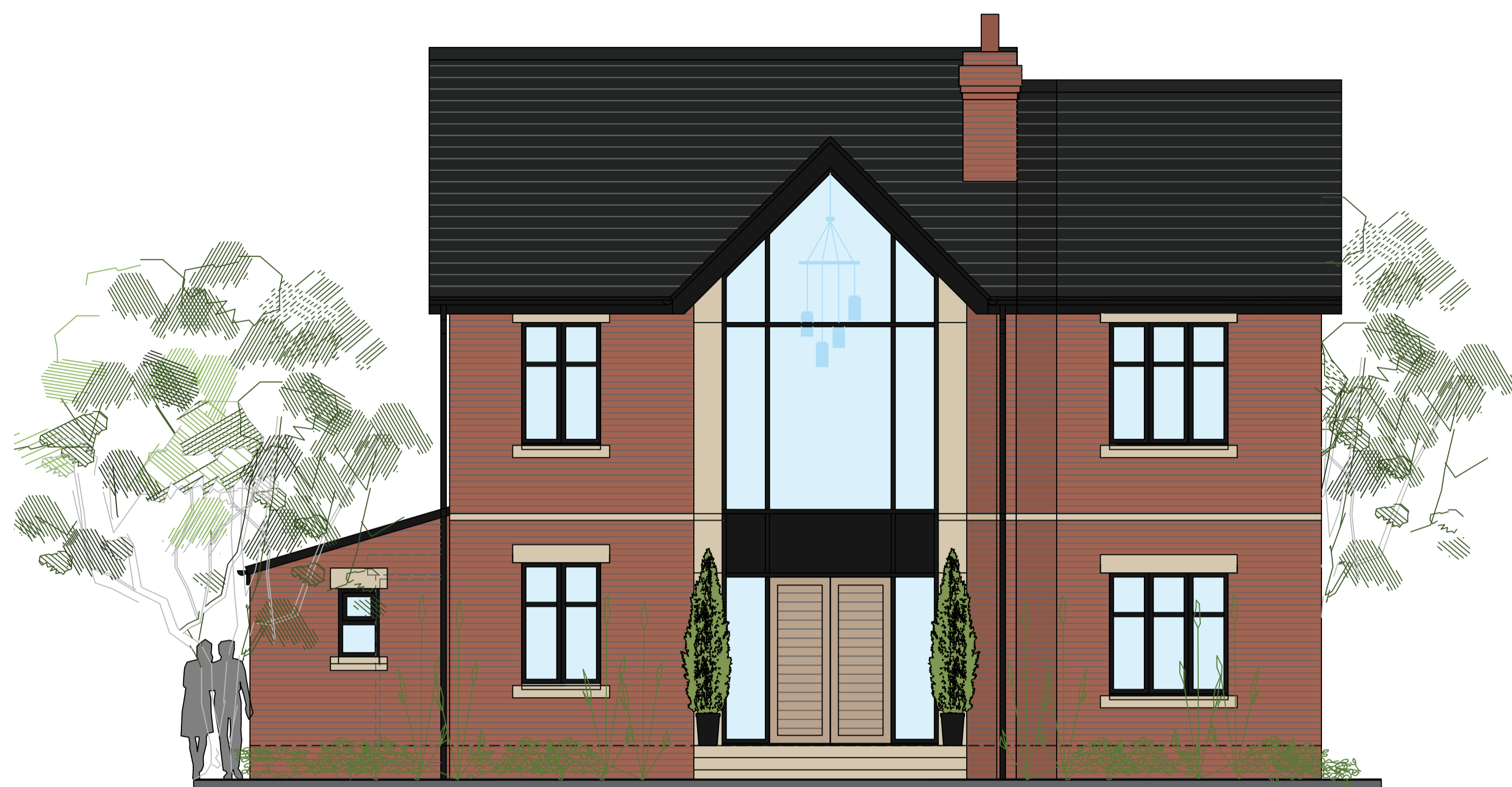
1:50 PROPOSED FRONT ELEVATION To Stockydale Road