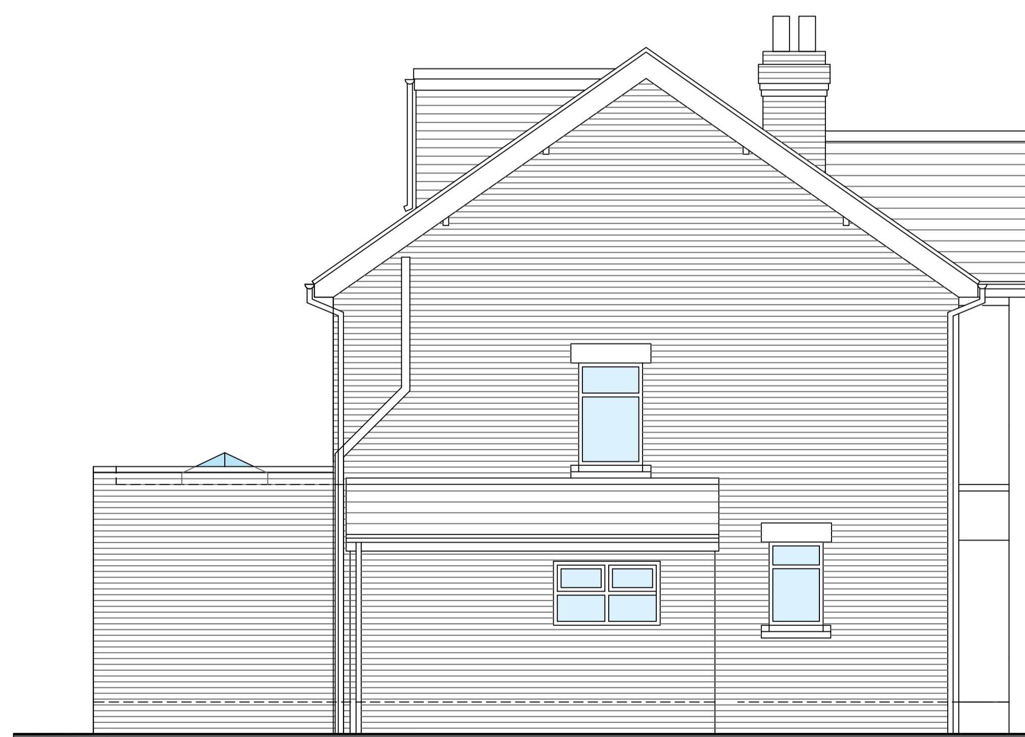
1:50 PROPOSED SIDE ELEVATION To No.29 Stockydale Road

THIS DRAWING AND ITS CONTENTS ARE AND REMAIN THE COPYRIGHT OF LINDSAY F ORAM CHARTERED ARCHITECT LIMITED. DO NOT SCALE. IF IN DOUBT SEEK CLARIFICATION.