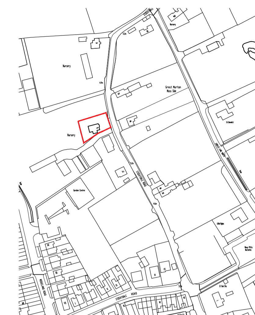
1:2500 SITE LOCATION PLAN