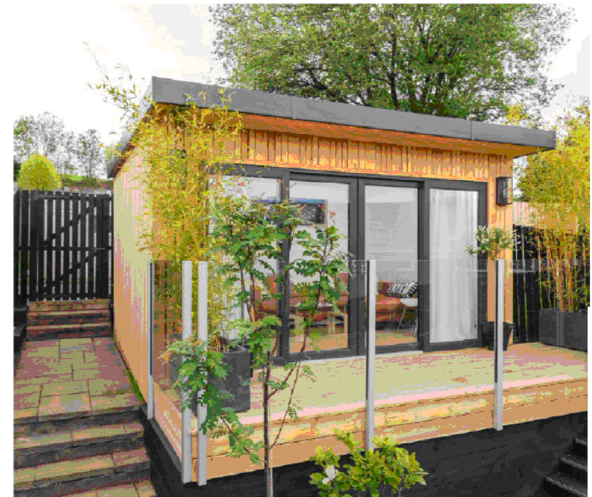
Example of 4.2m x 3m room with 3.6m doorset and extended decking to the front.