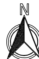
1 Proposed Site Location Plan 001 SCALE 1:1250