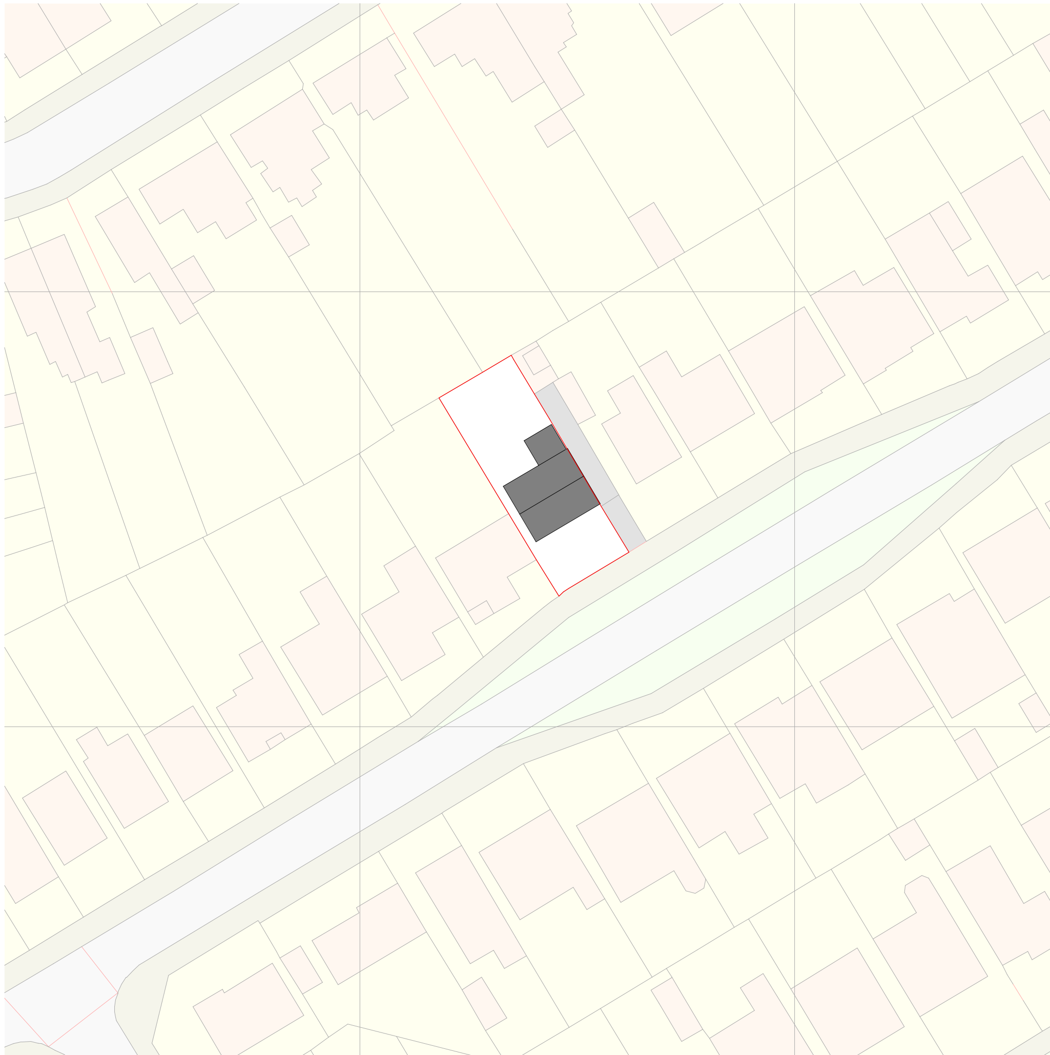
1 | Site Plan 1 : 500