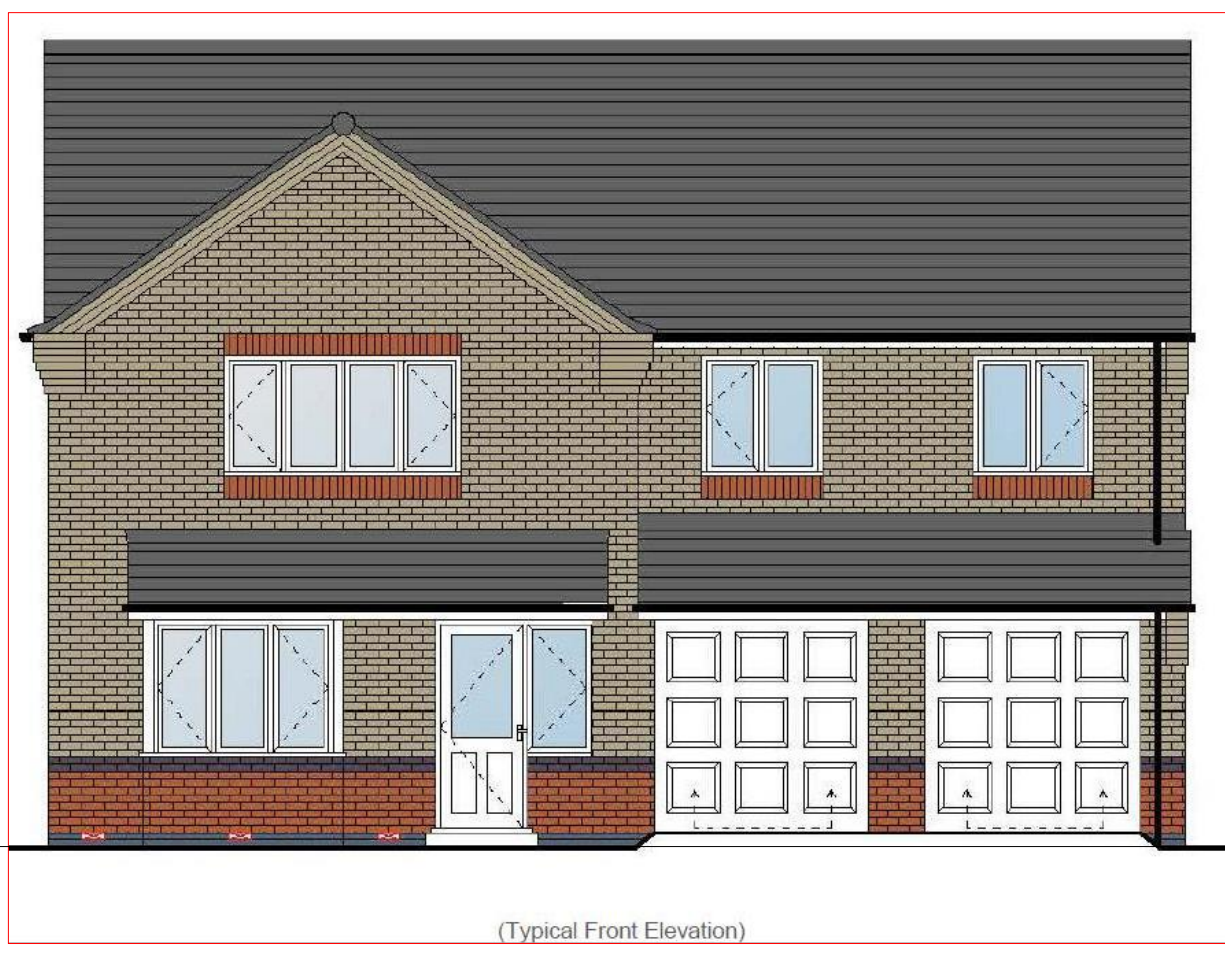
(Typical Front Elevation)

This drawing is to be checked against all other relevant drawings. Any dimensions are to be checked on site. All drawings are copyright of : dab : Architectural Consultancy Limited © **Do Not Scale From This Drawing** NB. These drawings are not for construction purposes, 'dab Architectural Consultancy Limited' bears no responsibility if used for this purpose.