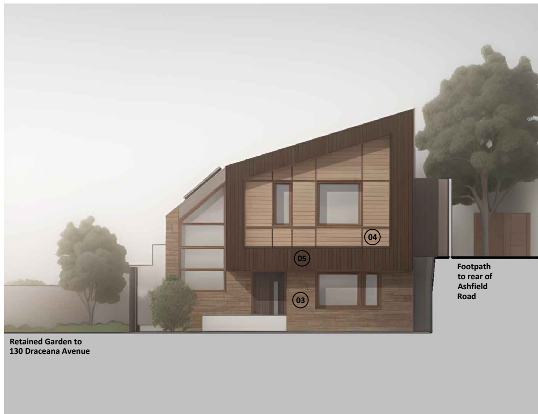
01 Proposed North Elevation