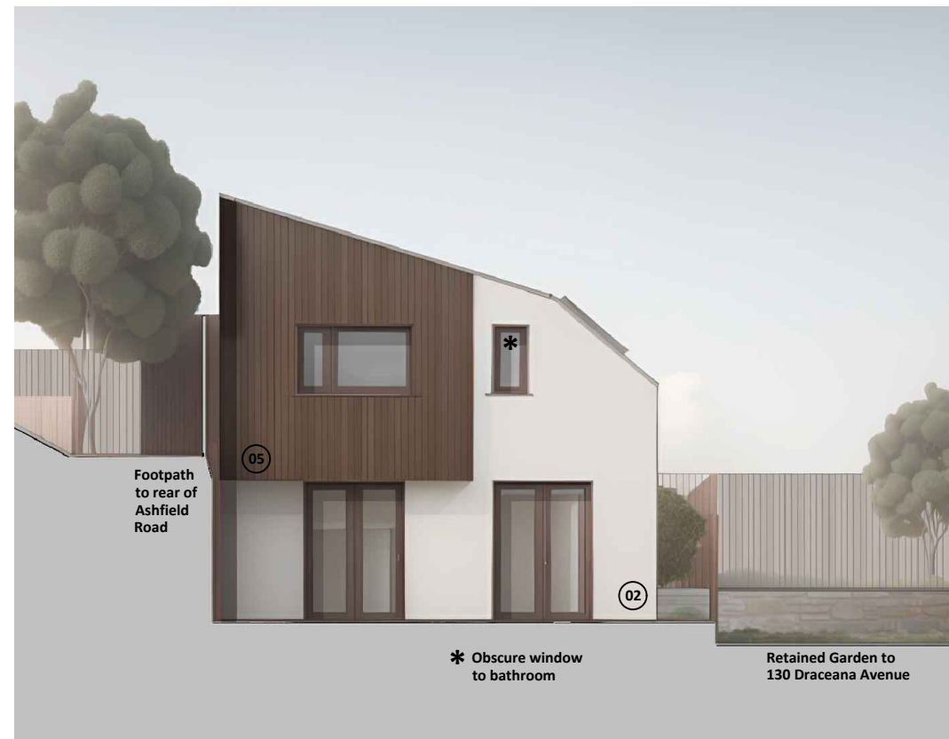
02 Proposed South Elevation