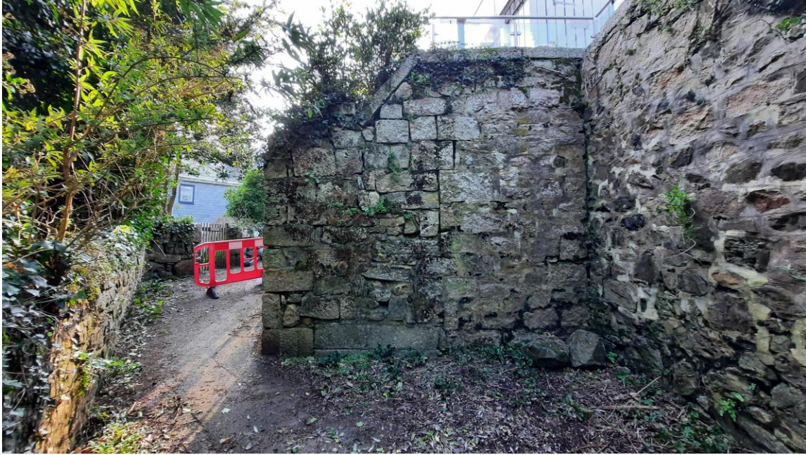
Figure 2 – Photograph of the North Elevation.