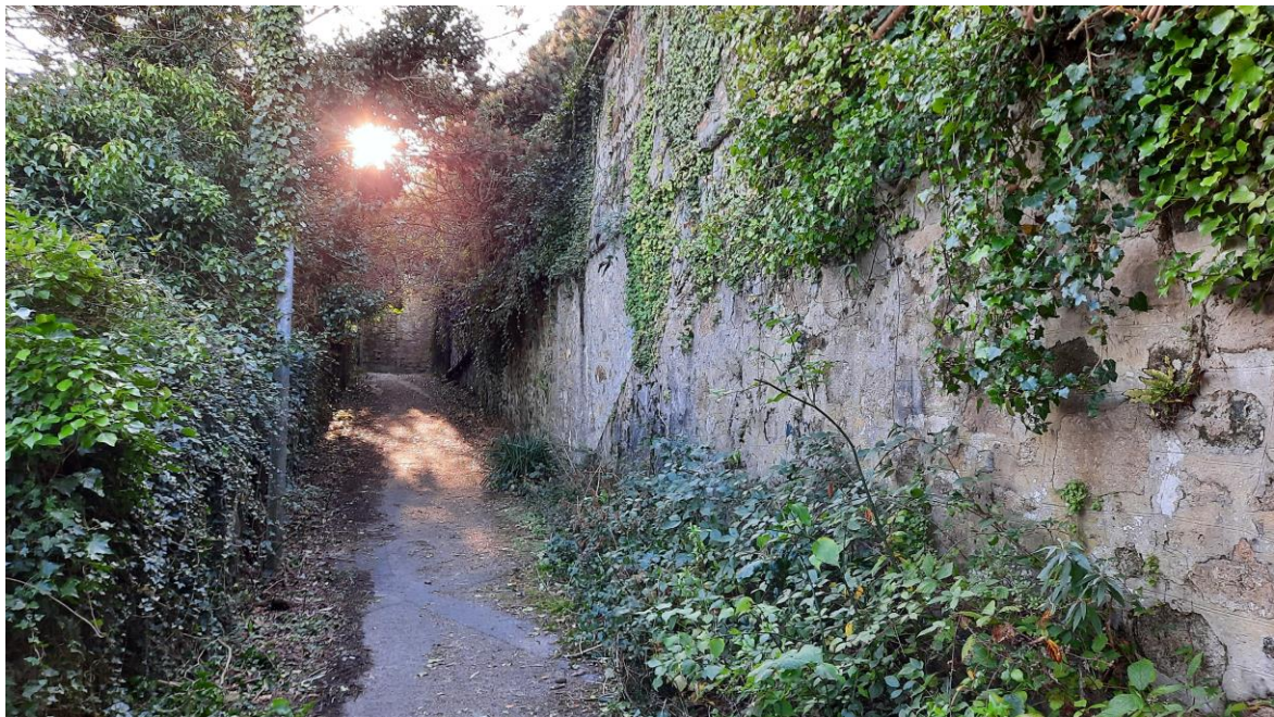
Figure 3 – Photograph showing existing retaining wall to the south end of the footpath.