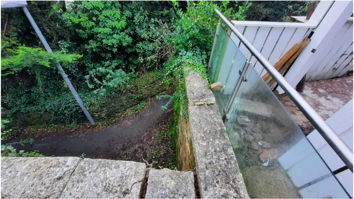
Figure 4 - Photograph showing existing coping stones and glass balustrade.