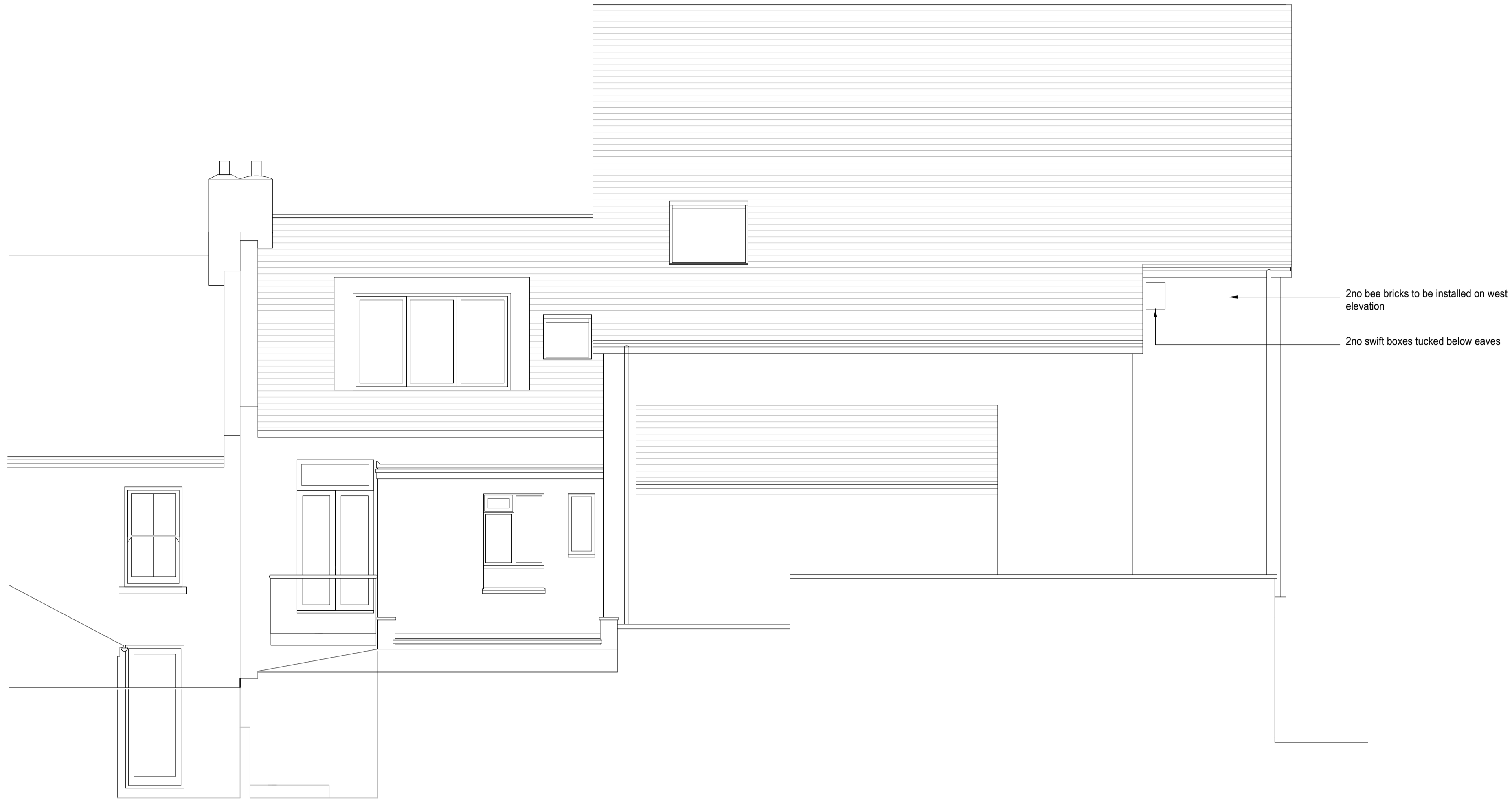
Proposed West Elevation 1:50