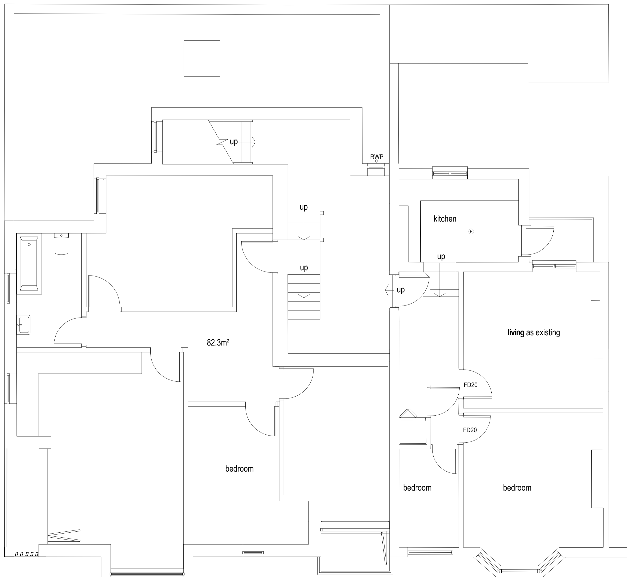
Proposed First Floor Plan 1:50