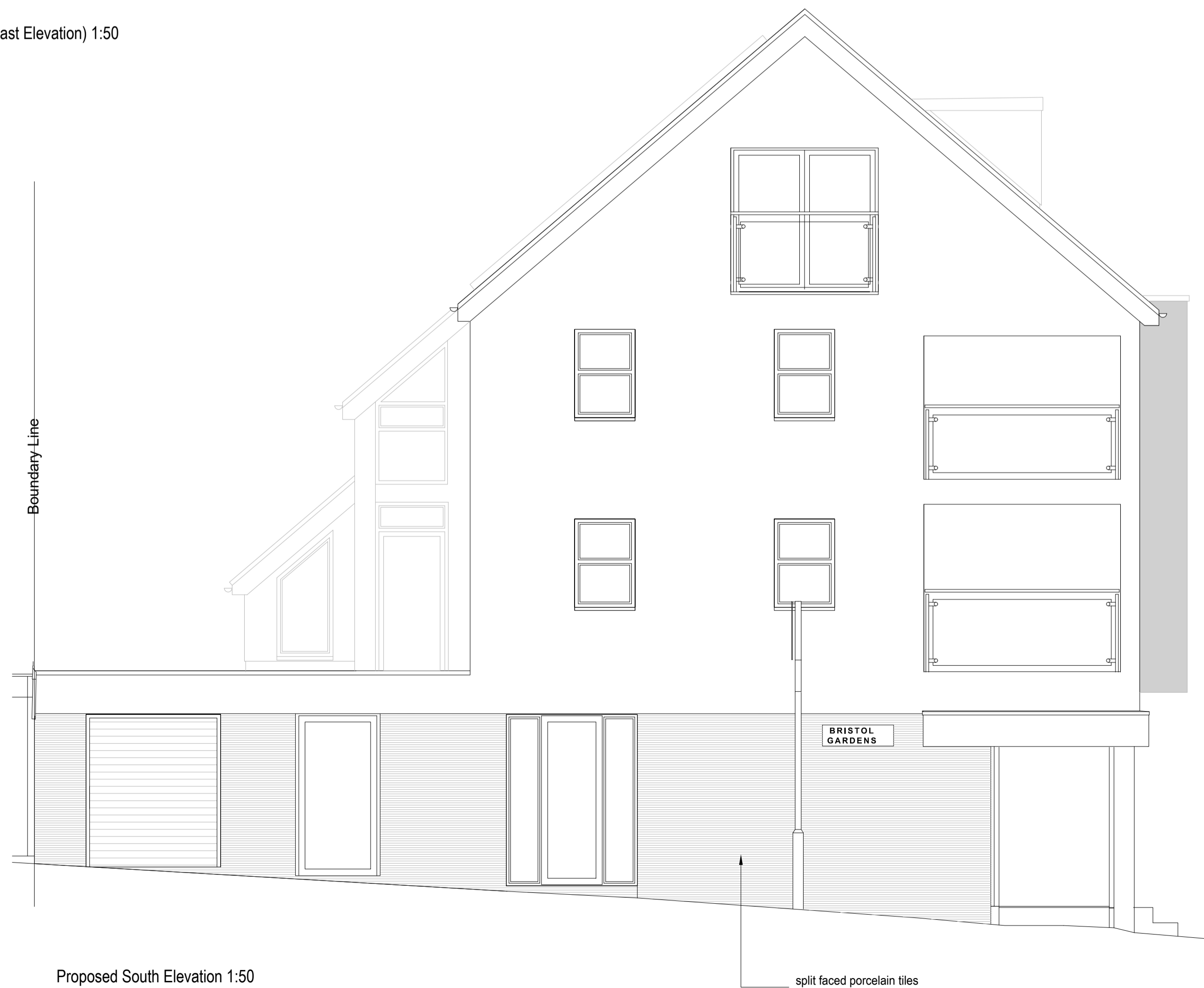
Proposed South Elevation 1:50