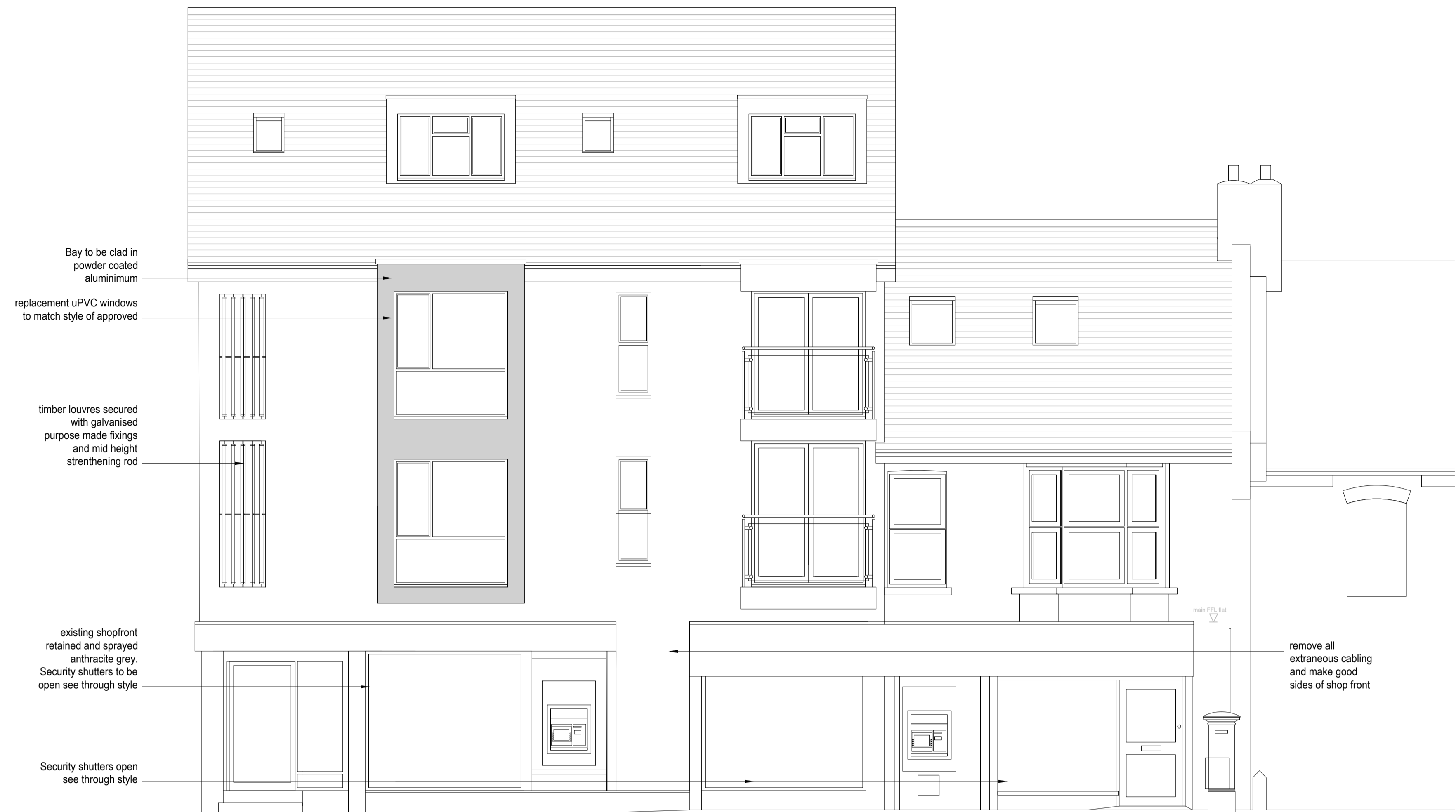
Proposed Front (East Elevation) 1:50