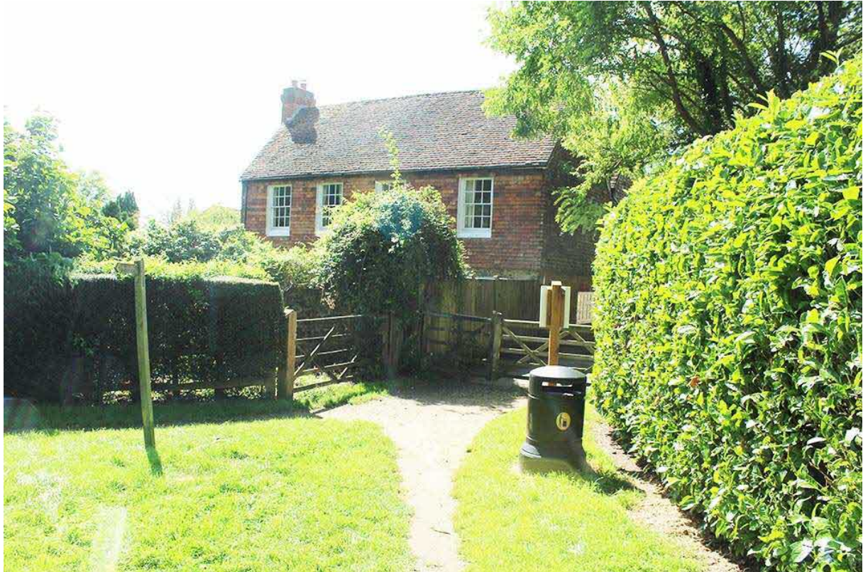
Figure 1 The existing parking area lies to the left, behind the five-bar gate and adjoining evergreen hedge, with the Listed Court Green behind.

south side immediately after passing through the gate and is separated from the castle site by a five-bar gate.