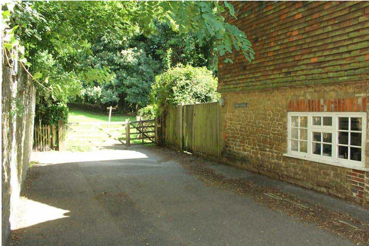
Figure 2 The existing entrance to the castle site (through the five-bar gate and adjoining pedestrian gate) looking eastwards along St. Ann's Hill, with Court Green to the right

In terms of groundwork, within the scheduled area the new fence with its gates will utilise the existing post-hole against the evergreen hedge and insert one new one to mount the eastern of the two gates. The only other postholes required, three in number, will be outside the scheduled area. The parking area itself, together with the new area of tarmac to the north, will require the reduction of the ground within its footprint to the surface of the subsoil in order to allow for an adequate sub-base, with a low Fittleworth stone retaining wall erected at its southern end. It is anticipated that the ground reduction will be no more than 300mm, including the footings for the retaining wall. It is suggested that a condition for an archaeological watching brief would be the most sensible mitigation for this, with suitable provisions being included within its Written Scheme of Investigation to allow for adjustments to the scheme should any significant remains be found.