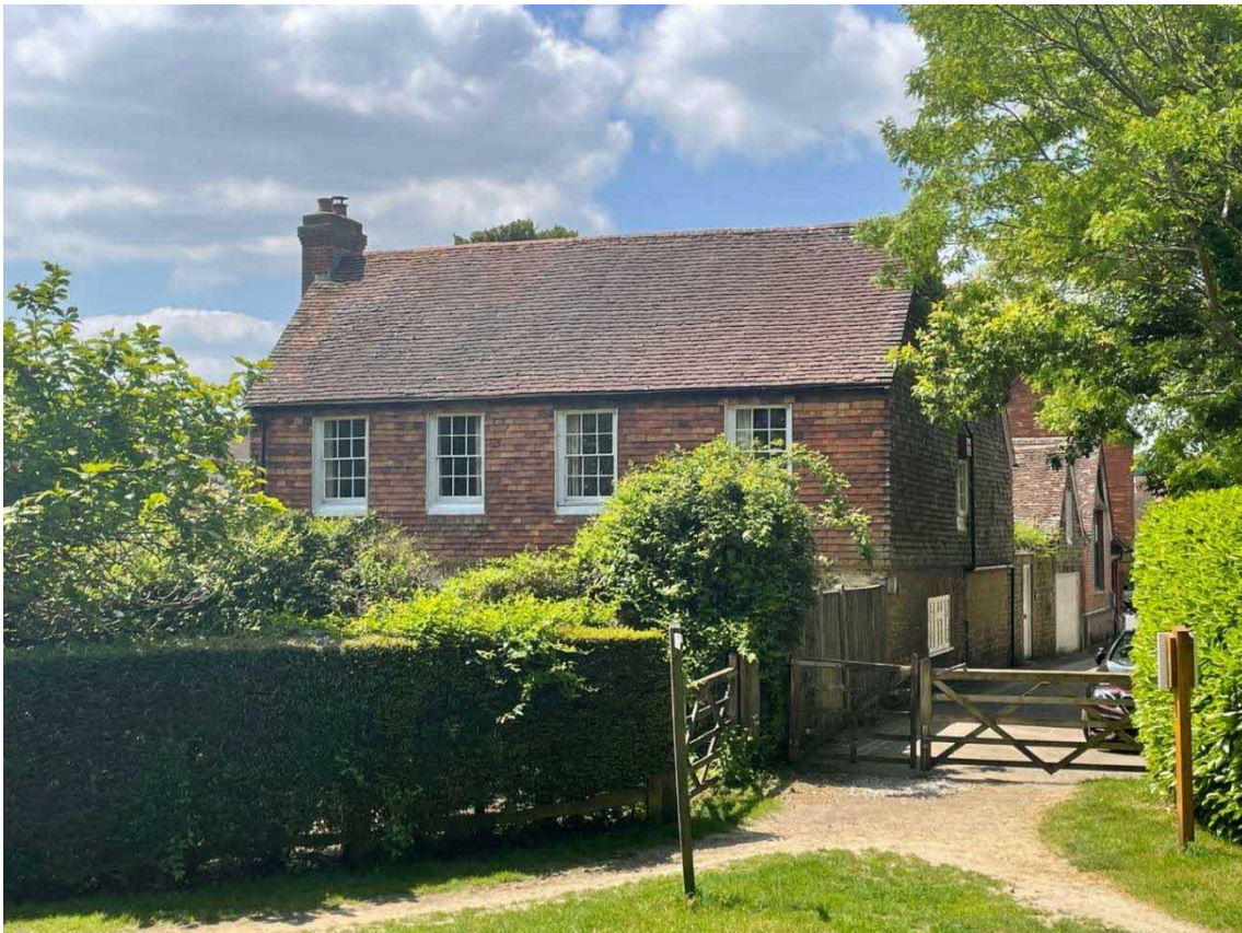
Front (East) Elevations taken from St Annes Hill