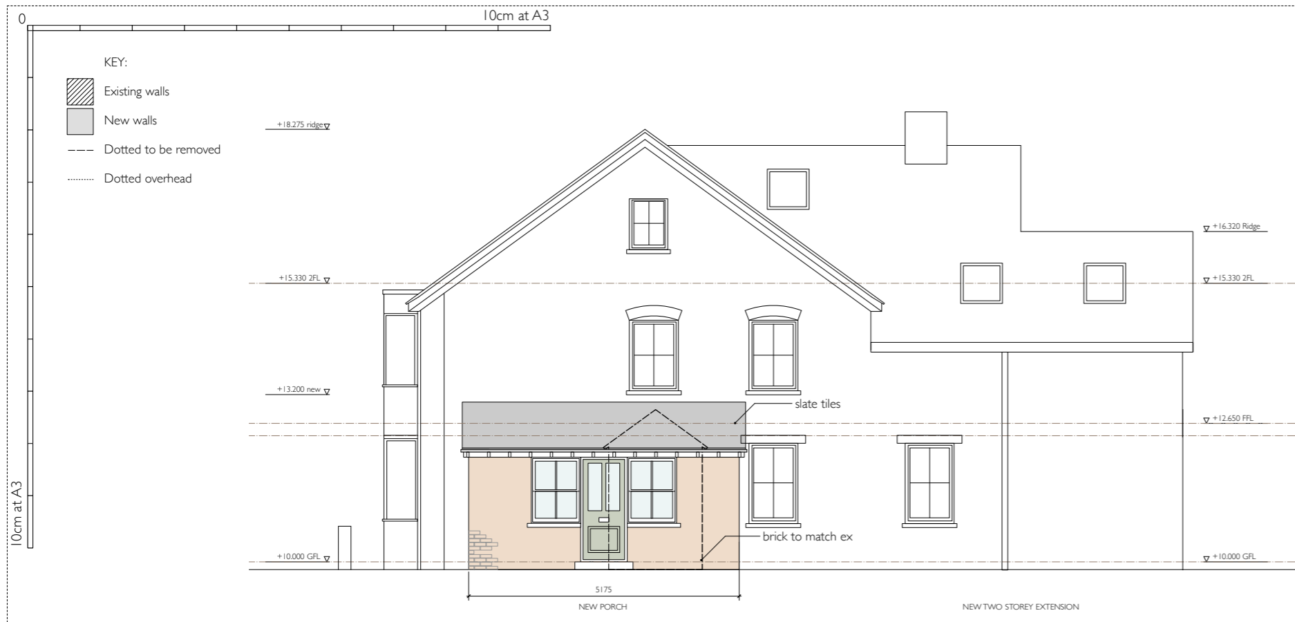
1 Proposed Side Elevation 1:100