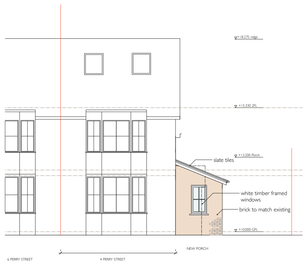
2 Proposed Front Elevation 1:100