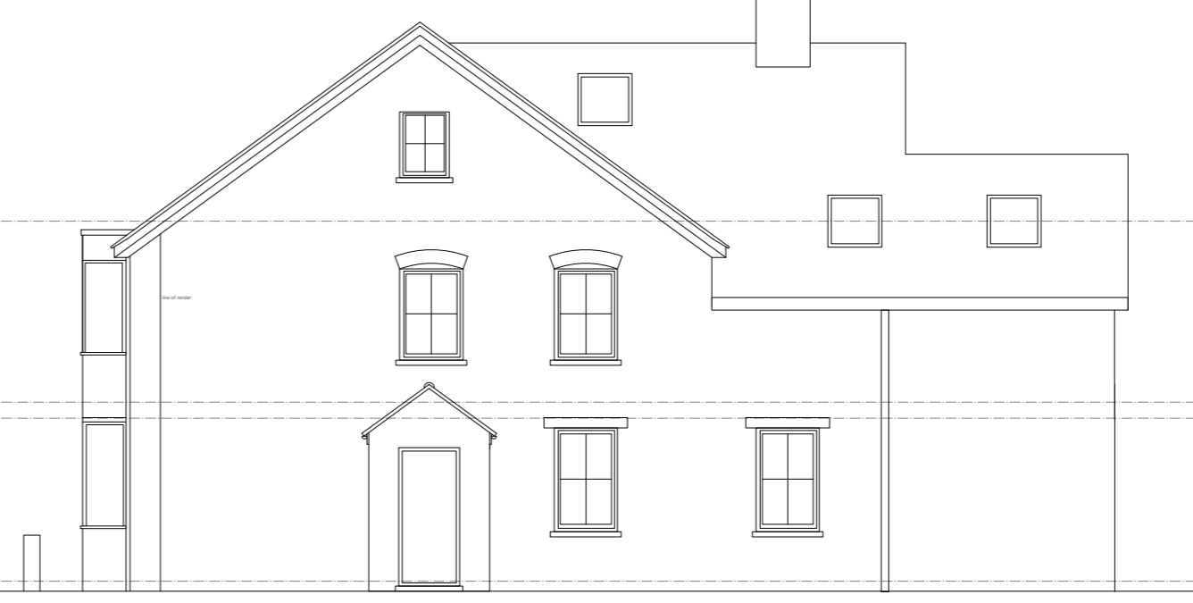
3 Existing Side Elevation 1:100