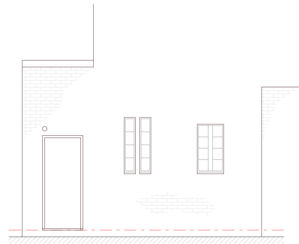
Rear Elevation as Existing Scale 1:50