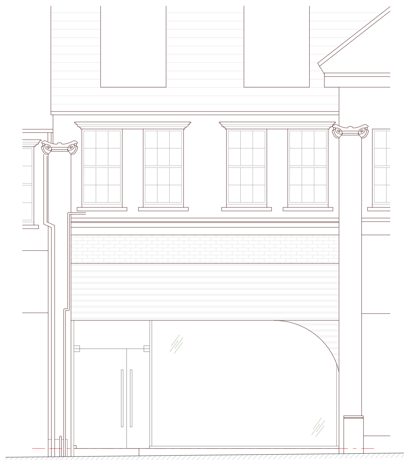
Front Elevation as Existing Scale 1:50