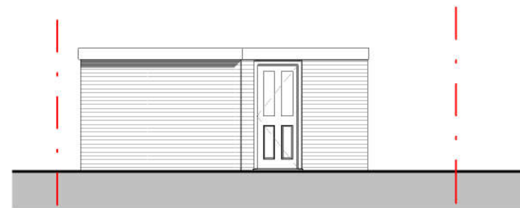
Existing Side Elevation West