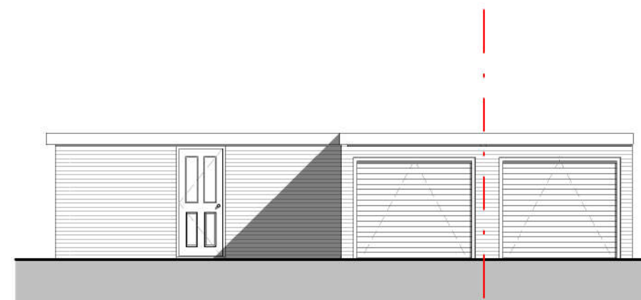
Existing Side Elevation South