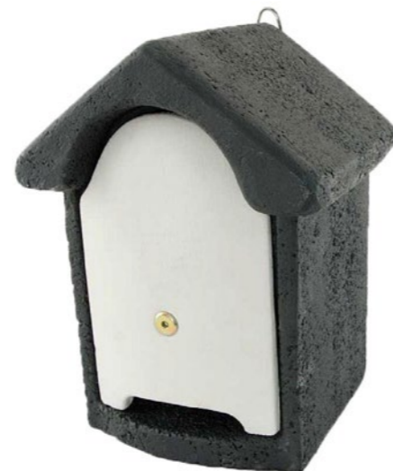
FT8A - BAT BOX

PRODUCT REFERENCE: HARLECH WOODSTONE BAT BOX MATERIAL: WOODCRETE DIMENSIONS: 310 X 200 X 270MM INSTALLATION: ON A STRONG LATERAL BRANCH OR ON A WALL CIRCA 5M HIGH (MINIMUM 3M HIGH). SOUTH WEST OR SOUTH EAST FACING