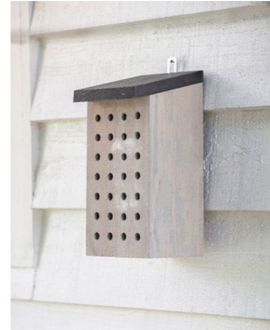
FT8B - BEE BOX

PRODUCT REFERENCE: SHETLAND RECTANGULAR BEE HOUSE - GREY MATERIAL: SPRUCE WOOD, NON-TOXIC STAIN DIMENSIONS: 260 X 120 X 120MM INSTALLATION: ON A STRONG LATERAL BRANCH IN FULL SUN OR LIGHT SHADE CIRCA 1-1.5M HIGH SOUTH OR SOUTH EAST FACING WITH NO VEGETATION IN FRONT OF IT OBSCURING THE ENTRANCES TO THE TUNNELS. IT MUST ALSO BE FIXED SECURELY TO PREVENT SHAKING AND SWAYING FROM WIND