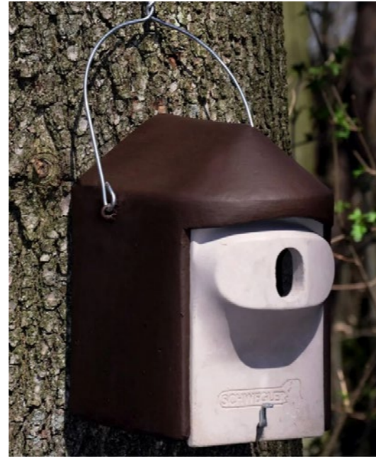
FT8 - BIRD NEST BOX

PRODUCT REFERENCE: SCHWEGLER 2GR NEST BOX - OVAL HOLE MATERIAL: WOODCRETE DIMENSIONS: 310 X 200 X 270MM INSTALLATION: ON A STRONG LATERAL BRANCH OR ON A WALL CIRCA 3M HIGH NORTH OR EAST FACING