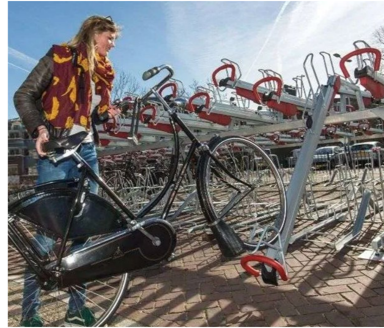
FT5 - 2 TIER CYCLE RACK

PRODUCT REFERENCE: SHEFFIELD RACK MATERIAL: STEEL FINISH: POWDER COATED COLOUR: BLACK FIXING: ROOT FIXED TO CONCRETE FOUNDATION BELOW SURFACE FINISH NUMBER OF ELEMENTS: 12 NUMBER OF SPACES: 24