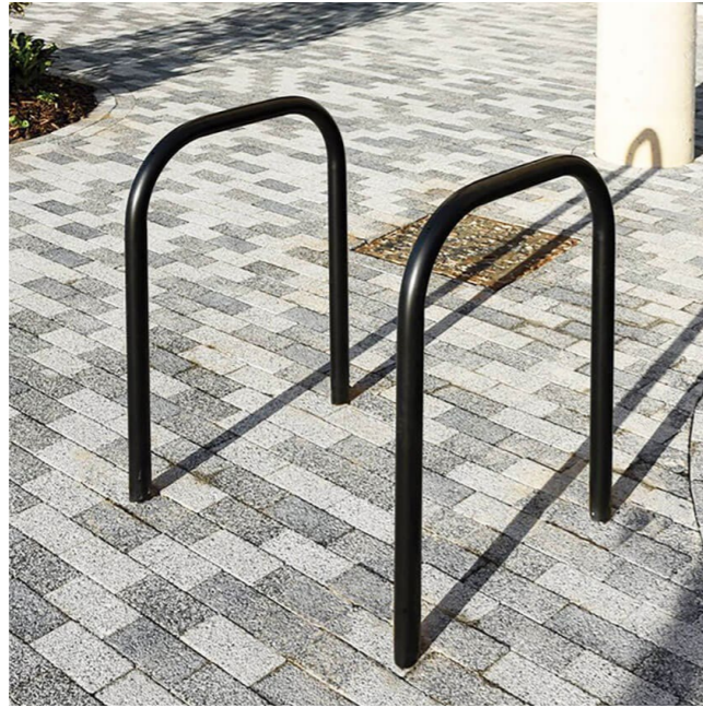
FT2 - SHEFFIELD CYCLE RACK

PRODUCT REFERENCE: SHEFFIELD RACK MATERIAL: STEEL FINISH: POWDER COATED COLOUR: BLACK FIXING: ROOT FIXED TO CONCRETE FOUNDATION BELOW SURFACE FINISH NUMBER OF ELEMENTS: 12 NUMBER OF SPACES: 24