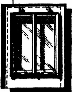
CR-1 UNIT 1:20 SCALE