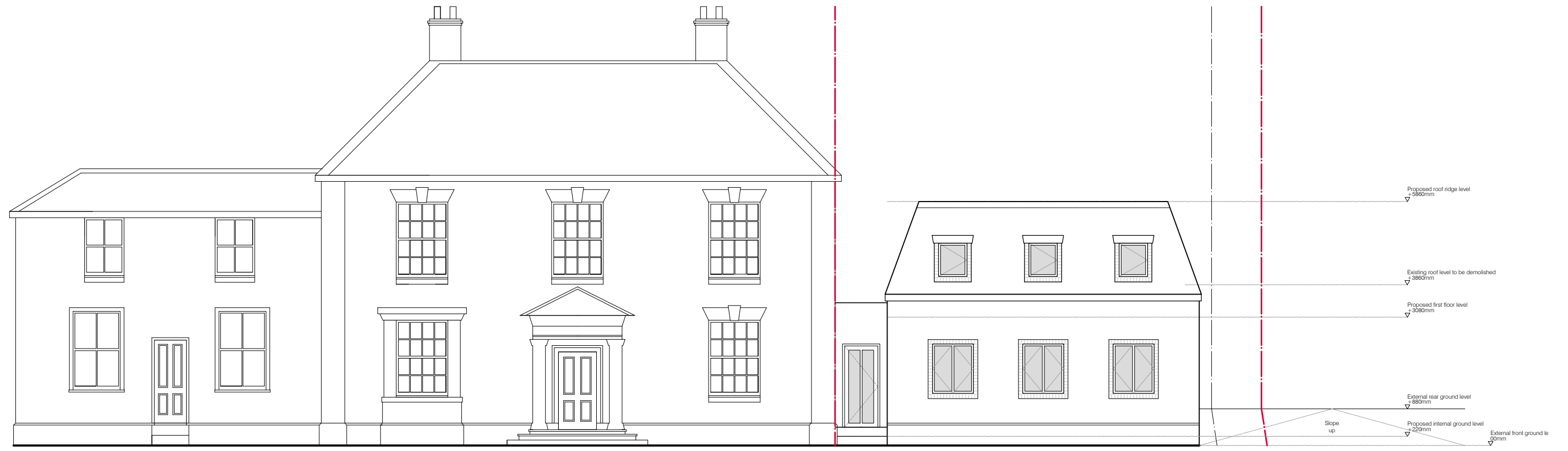
Kent House 155