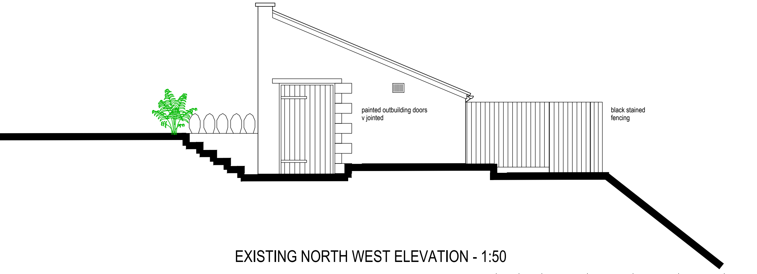
EXISTING NORTH WEST ELEVATION - 1:50

rubble stone walls with cock and hen copings