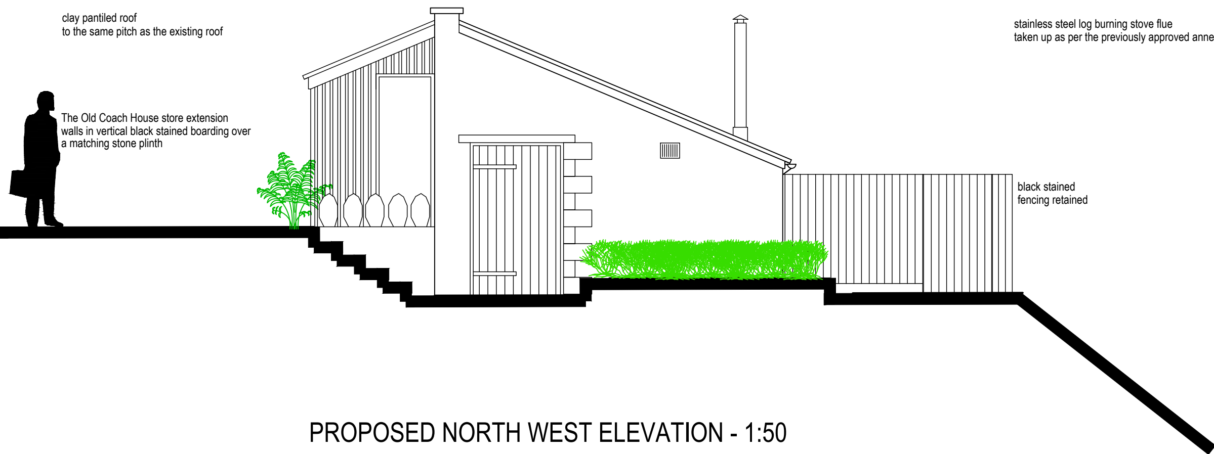
PROPOSED NORTH WEST ELEVATION - 1:50

stainless steel log burning stove flue taken up as per the previously approved annexe scheme