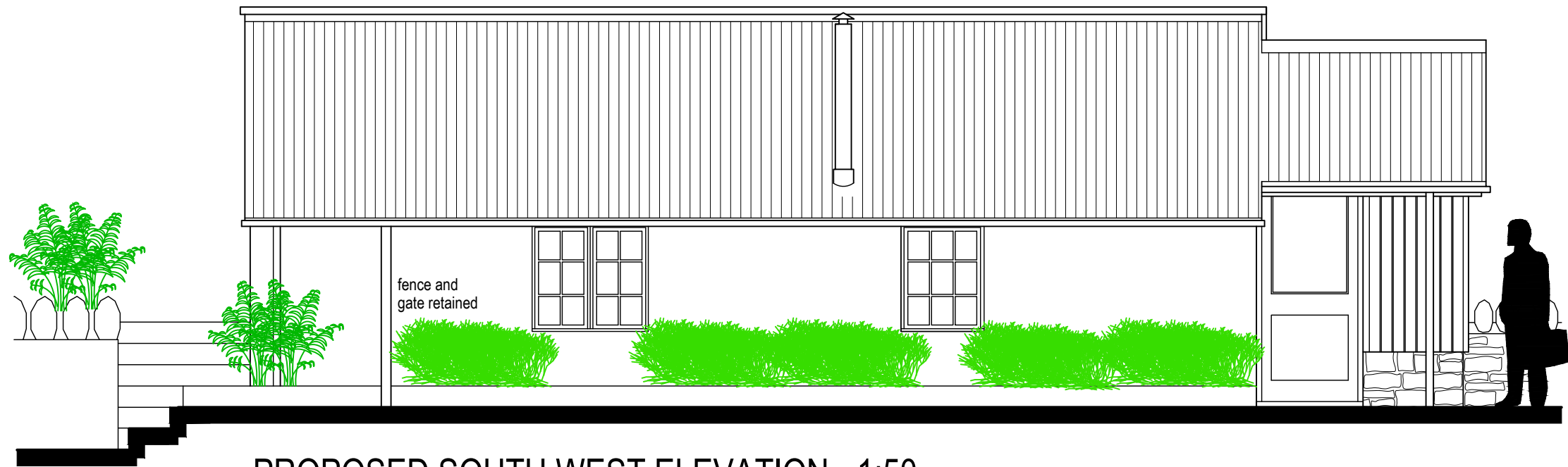
PROPOSED SOUTH WEST ELEVATION - 1:50

clay pantiled roof with traditional profile gutter on the same line as the existing roof new wall to be vertical recessed pine boarding above a matching rubble stone plinth door a simple 2 panel half glazed door, with black paint finish rubble stone walls with cock and hen copings retained