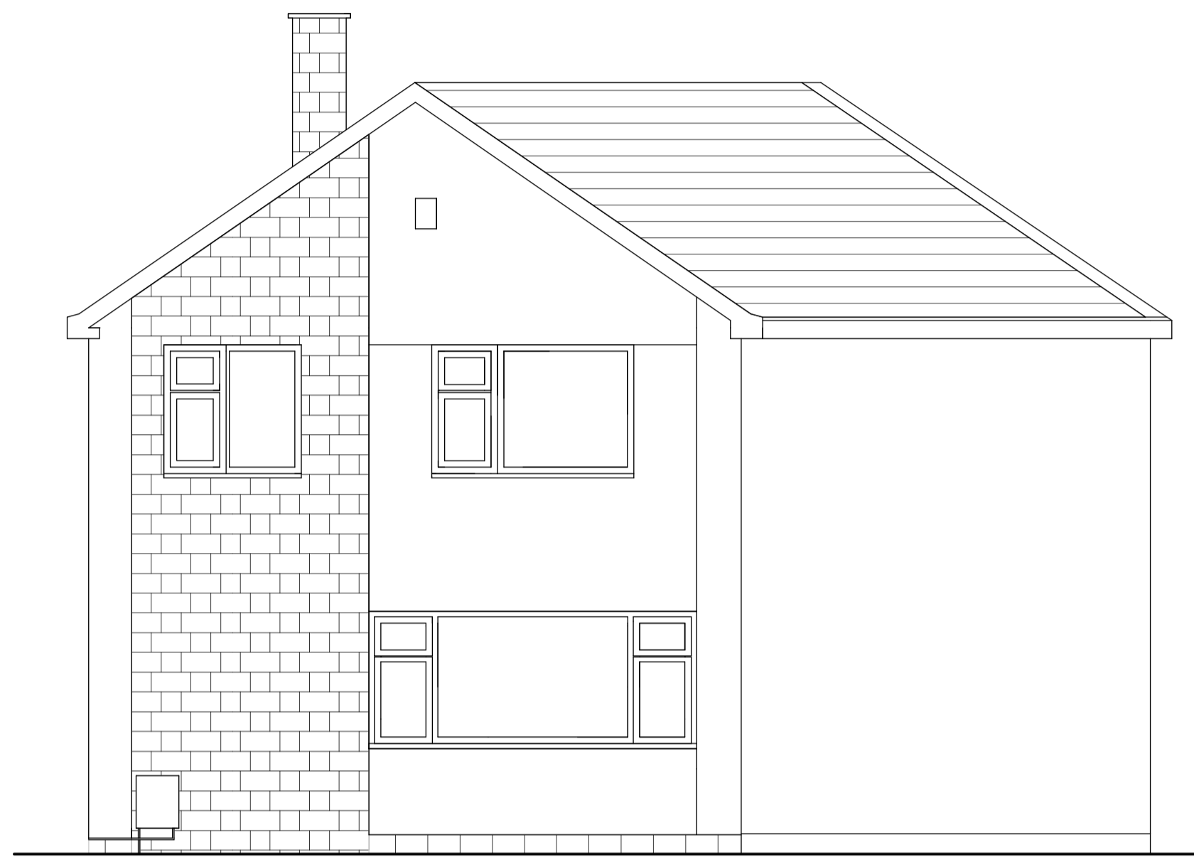
Front Elevation (facing south)