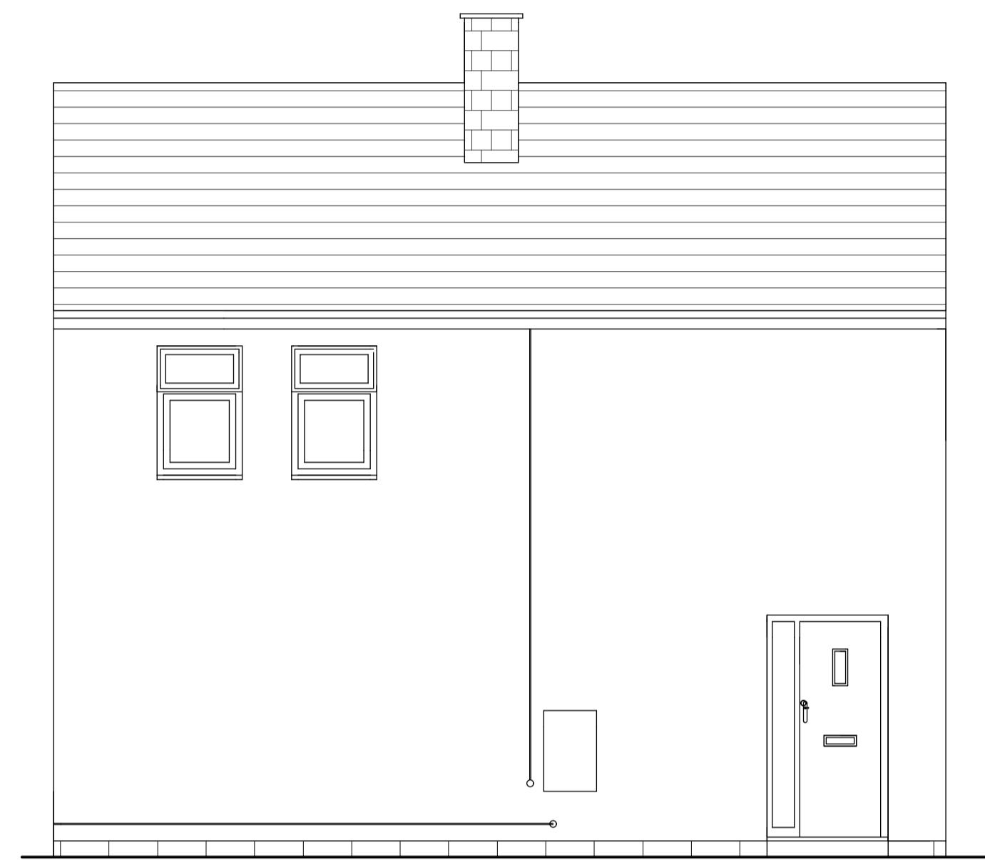
Side Elevation (facing west)