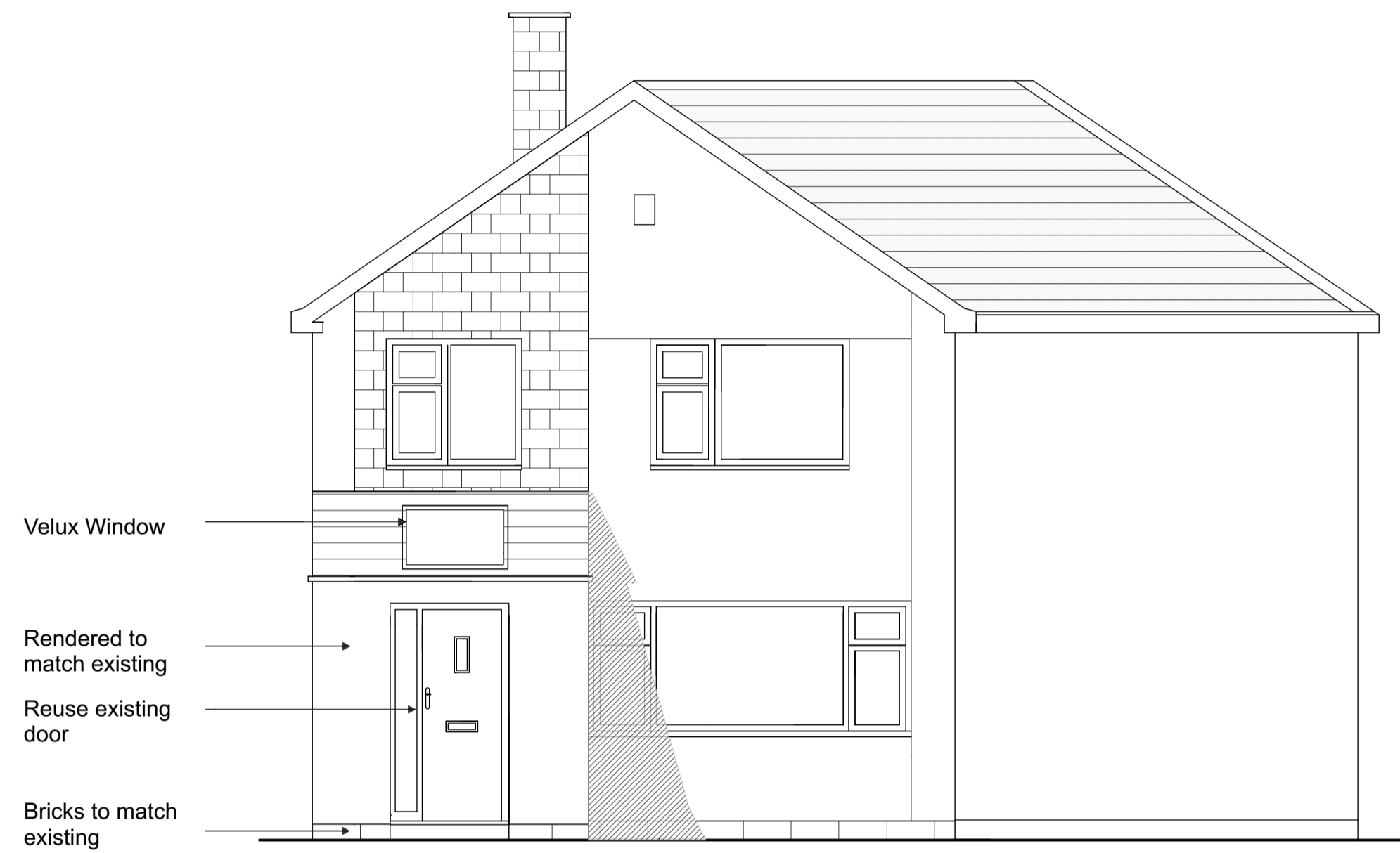
Front Elevation (facing south)