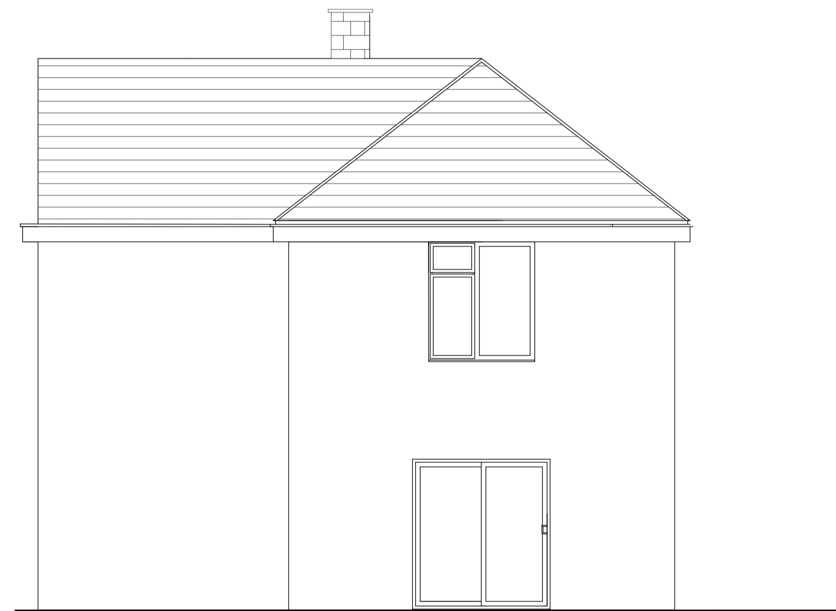
Side Elevation (facing east)