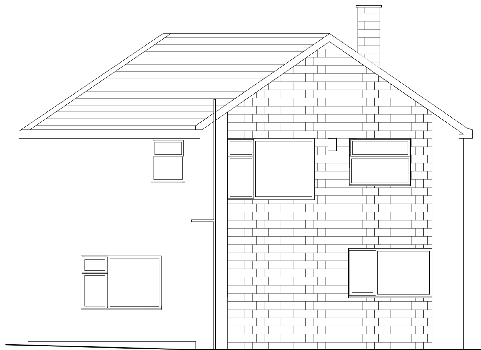
Back Elevation (facing north)