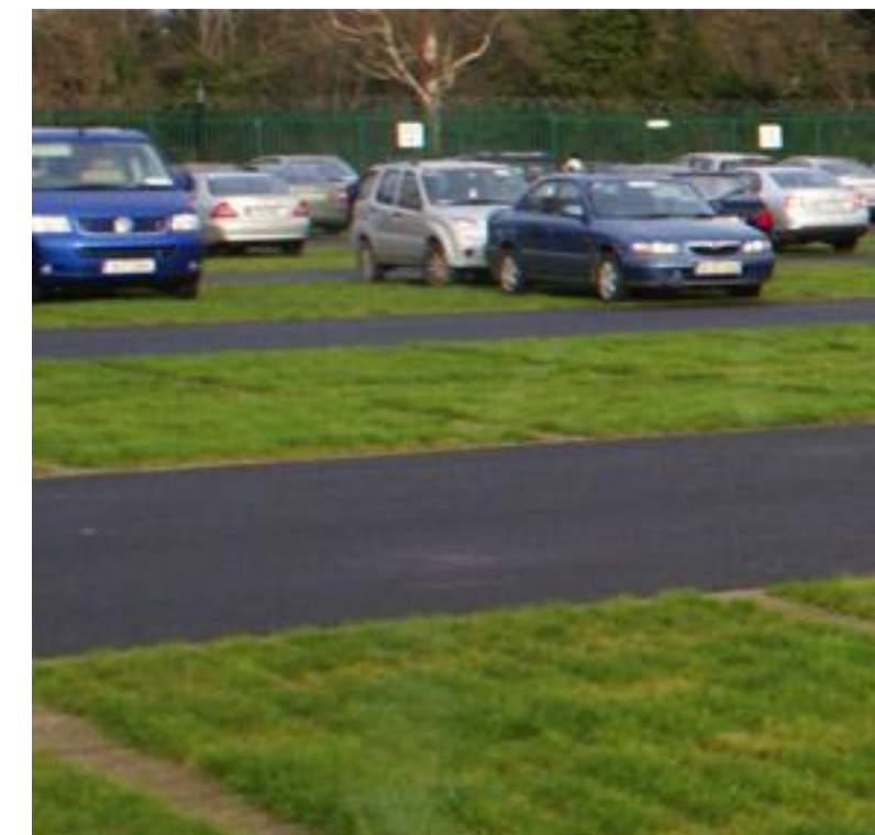
Proposed parking spaces to be formed in reinforced grass paving such as 'Grasscrete'