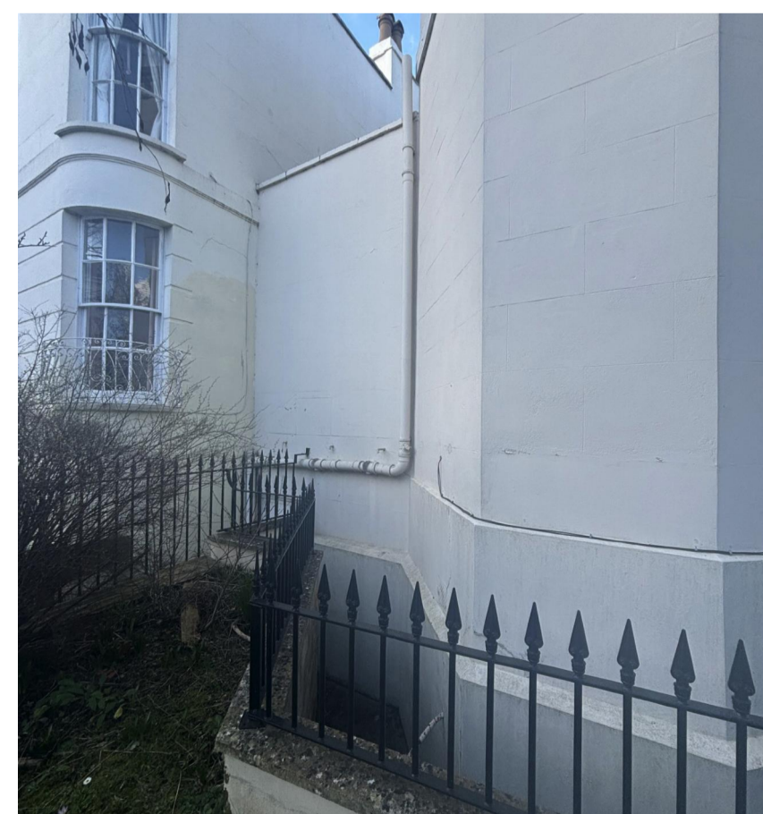
4 Existing drain on East Elevation