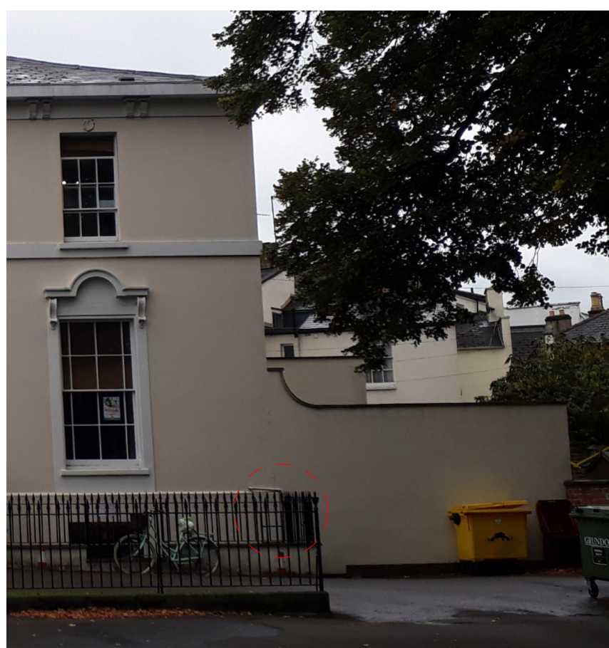
1 Existing drain on North Elevation