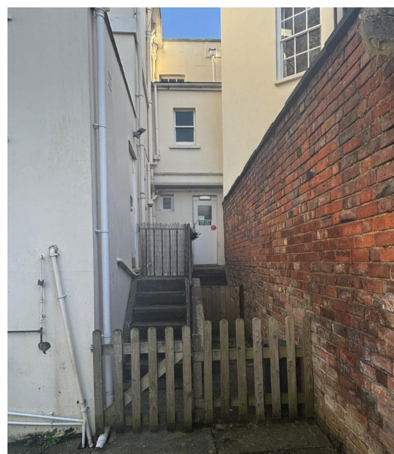
2 Existing drains on West Elevation