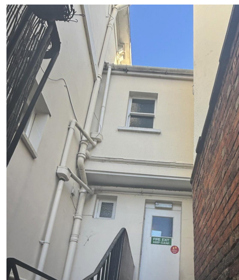
3 Existing drains on West Elevation