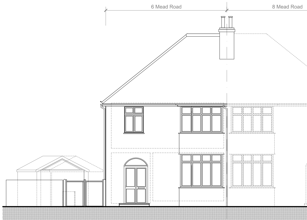
01 Existing Front Elevation Scale 1:100