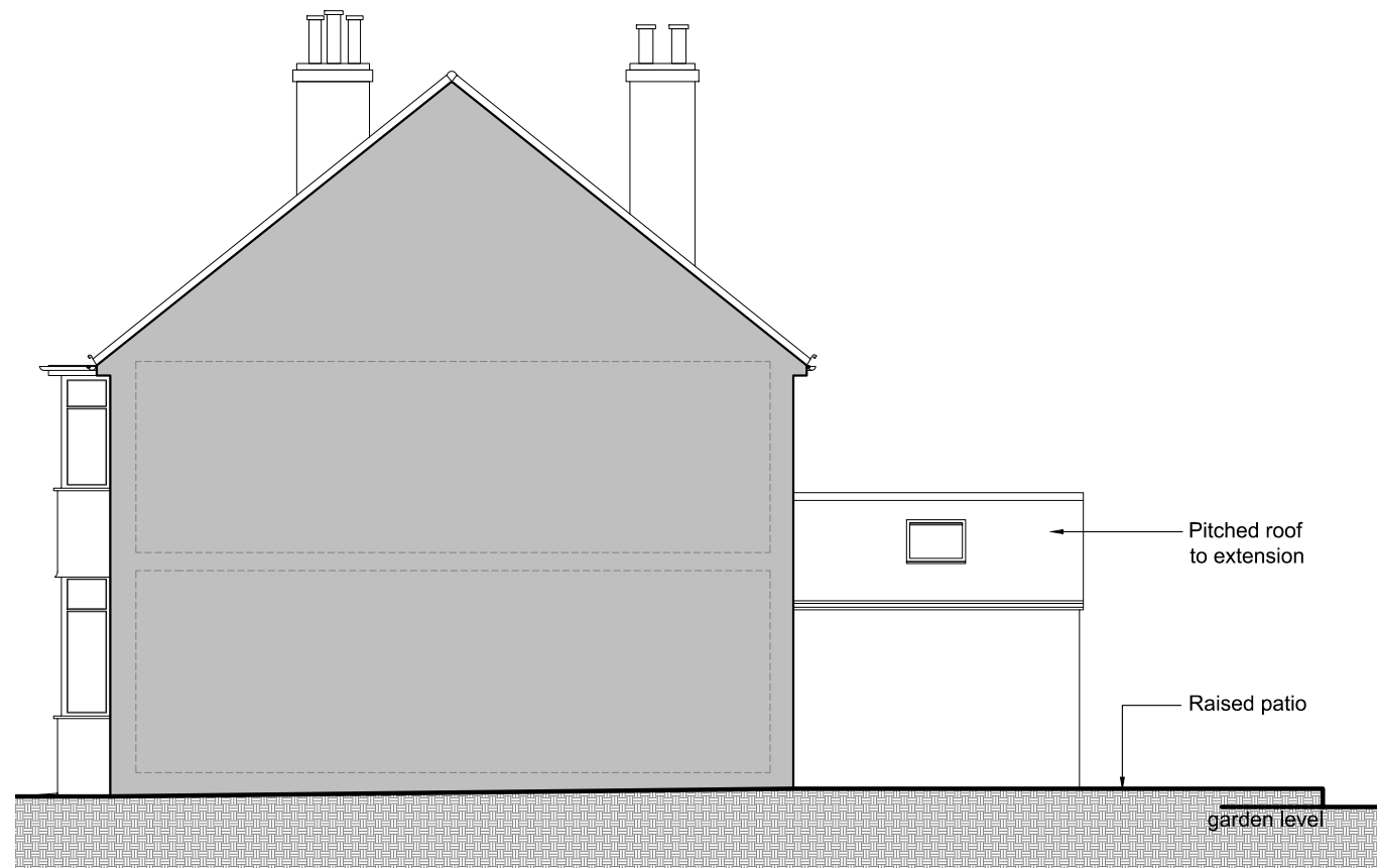
04 Existing Side Elevation from No.8 Scale 1:100

NOTES DO NOT SCALE DRAWING DRAWING PROVIDED FOR PLANNING DISCUSSION ONLY AND IS NOT INTENDED FOR CONSTRUCTION ALL DETAILS ARE INDICATIVE. CONTRACTOR TO PROVIDE FULL CONSTRUCTION DETAILS PRIOR TO COMMENCEMENT OF WORKS