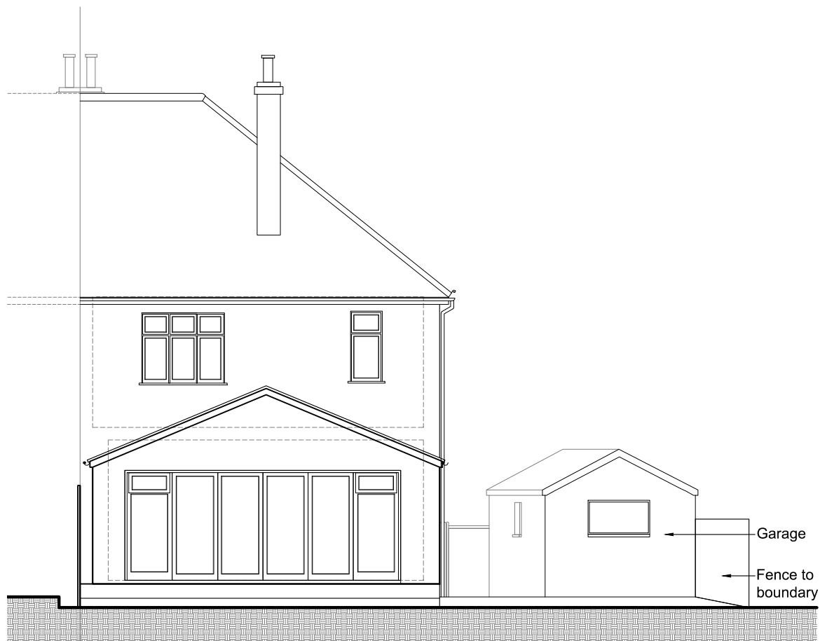
03 Existing Rear Elevation Scale 1:100