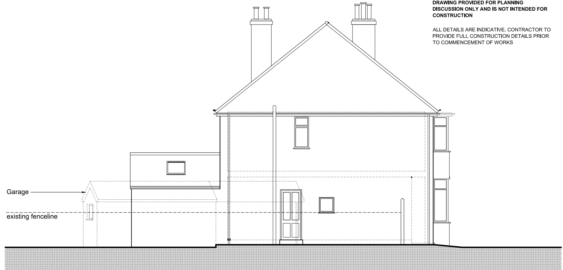
02 Existing Side Elevation from No.4 Scale 1:100