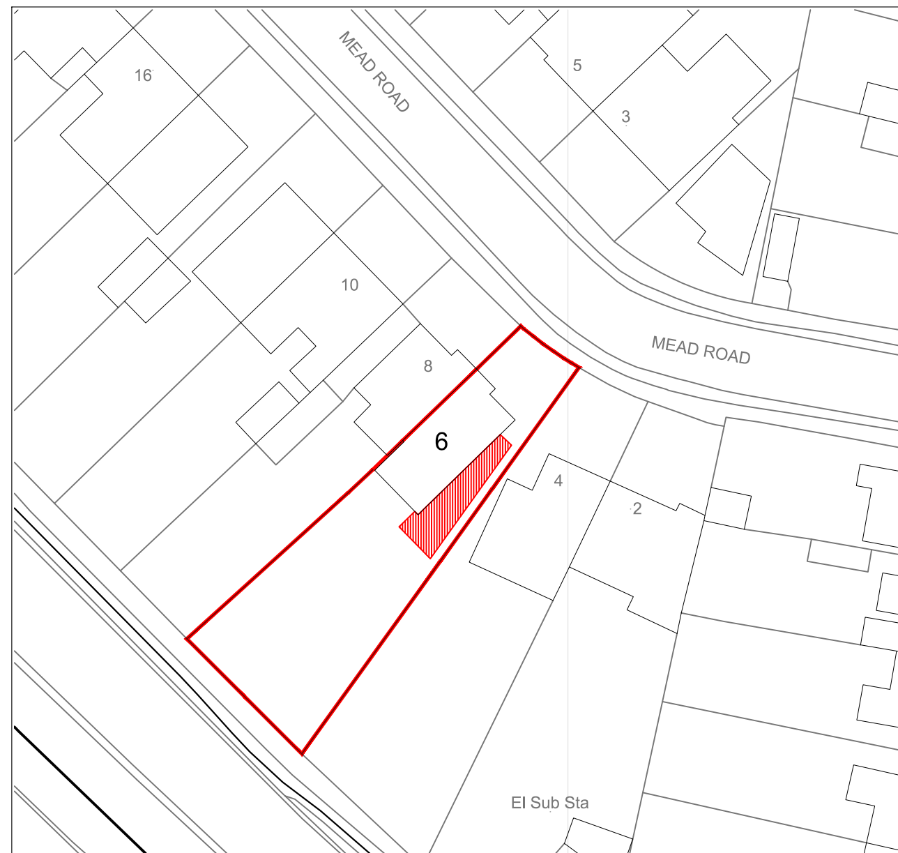
02 Proposed Block Plan Scale 1:500