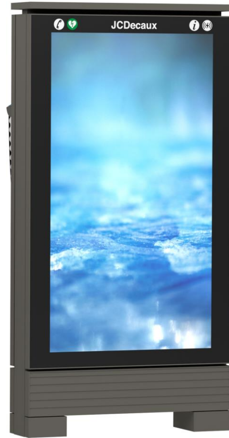
Proposed Communication Hub Unit