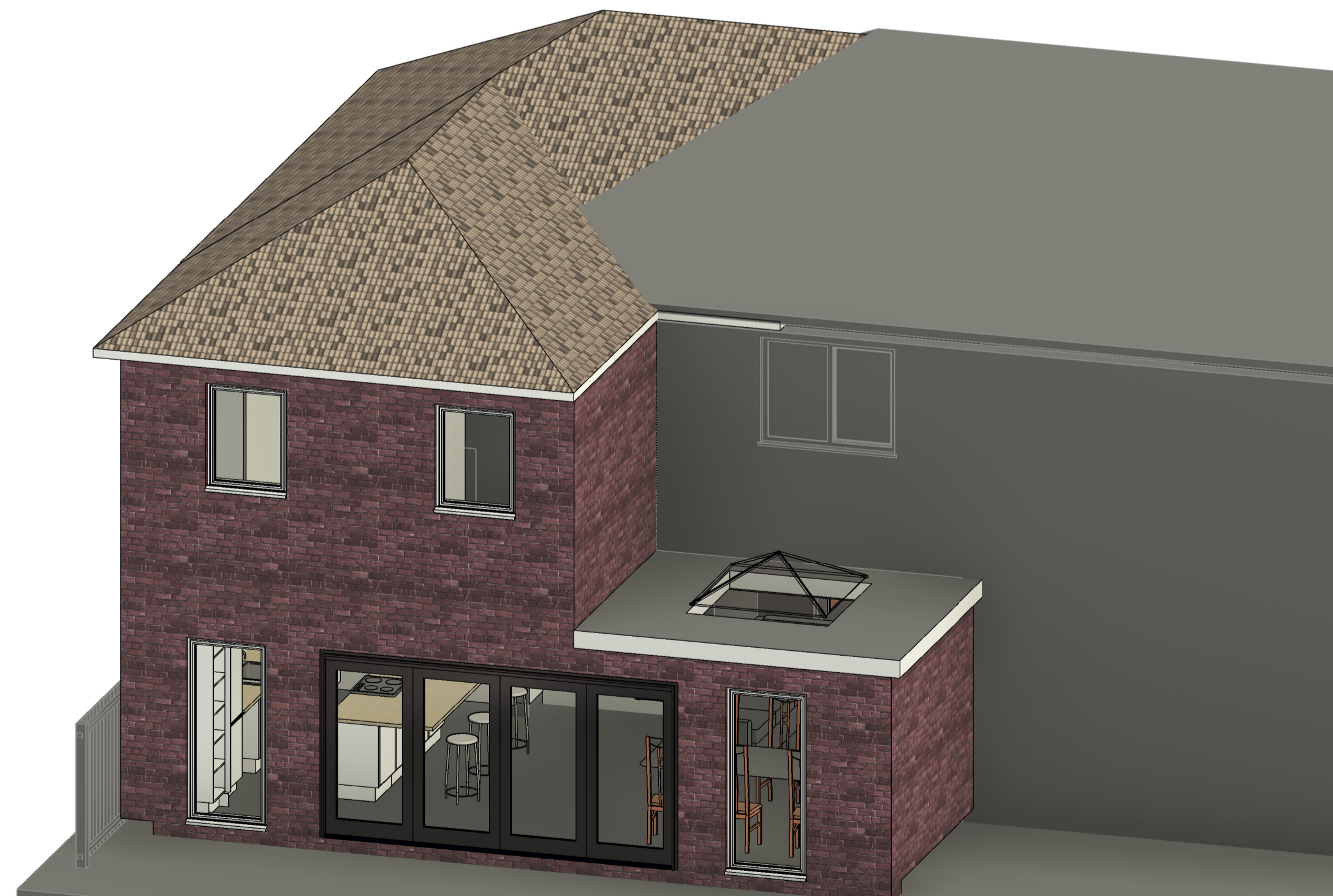
2 PROPOSED REAR 3D VIEW