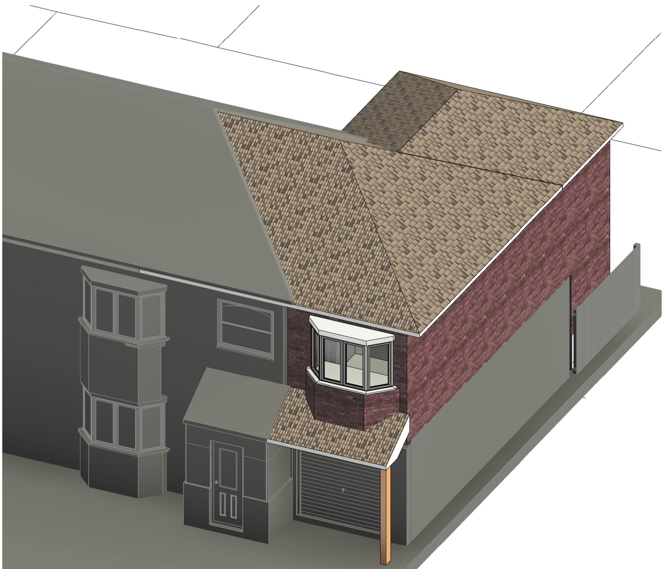
3 PROPOSED FRONT 3D