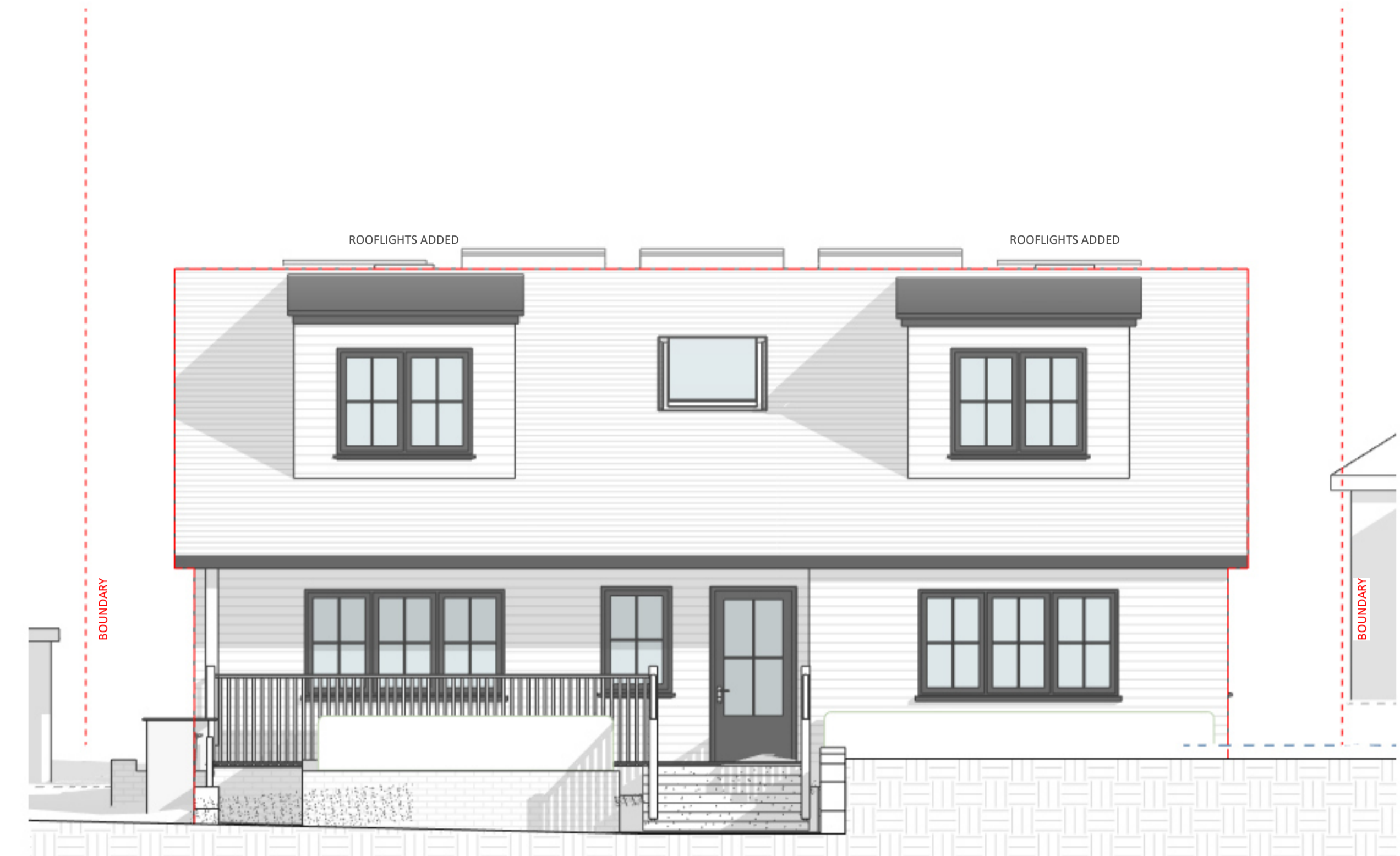
1 3.2 North West Facing Elevation 1:50