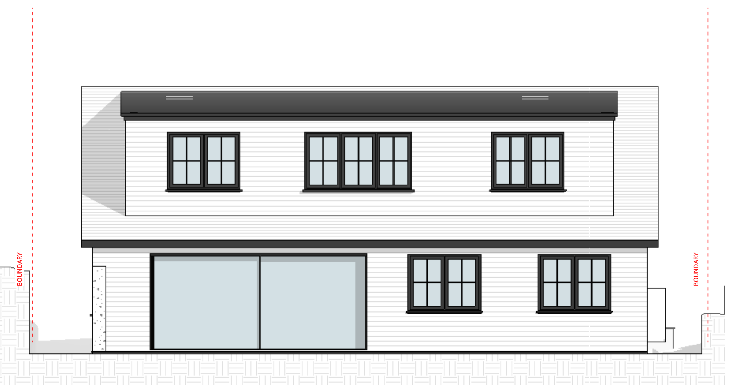
4 1.2 East Facing Elevation 1:50