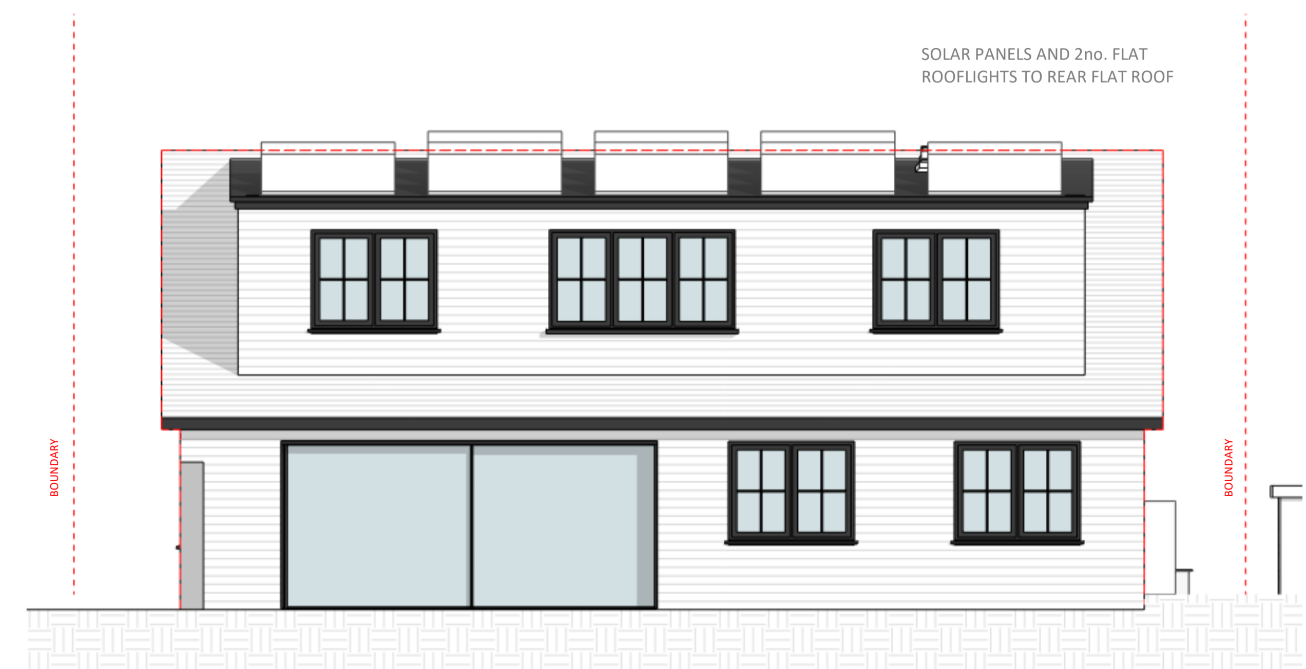
2 3.2 South East Facing Elevation 1:50

EXISTING AND PROPOSED MATERIAL PALETTE WALLS: WHITE CEDRAL CLADDING ROOF: CAMBRIAN REDLAND SLATE ROOF TO MAIN HOUSE, EPDM ROOF TO DORMERS OPENINGS: BLACK FRAMES TO ALL OPENINGS