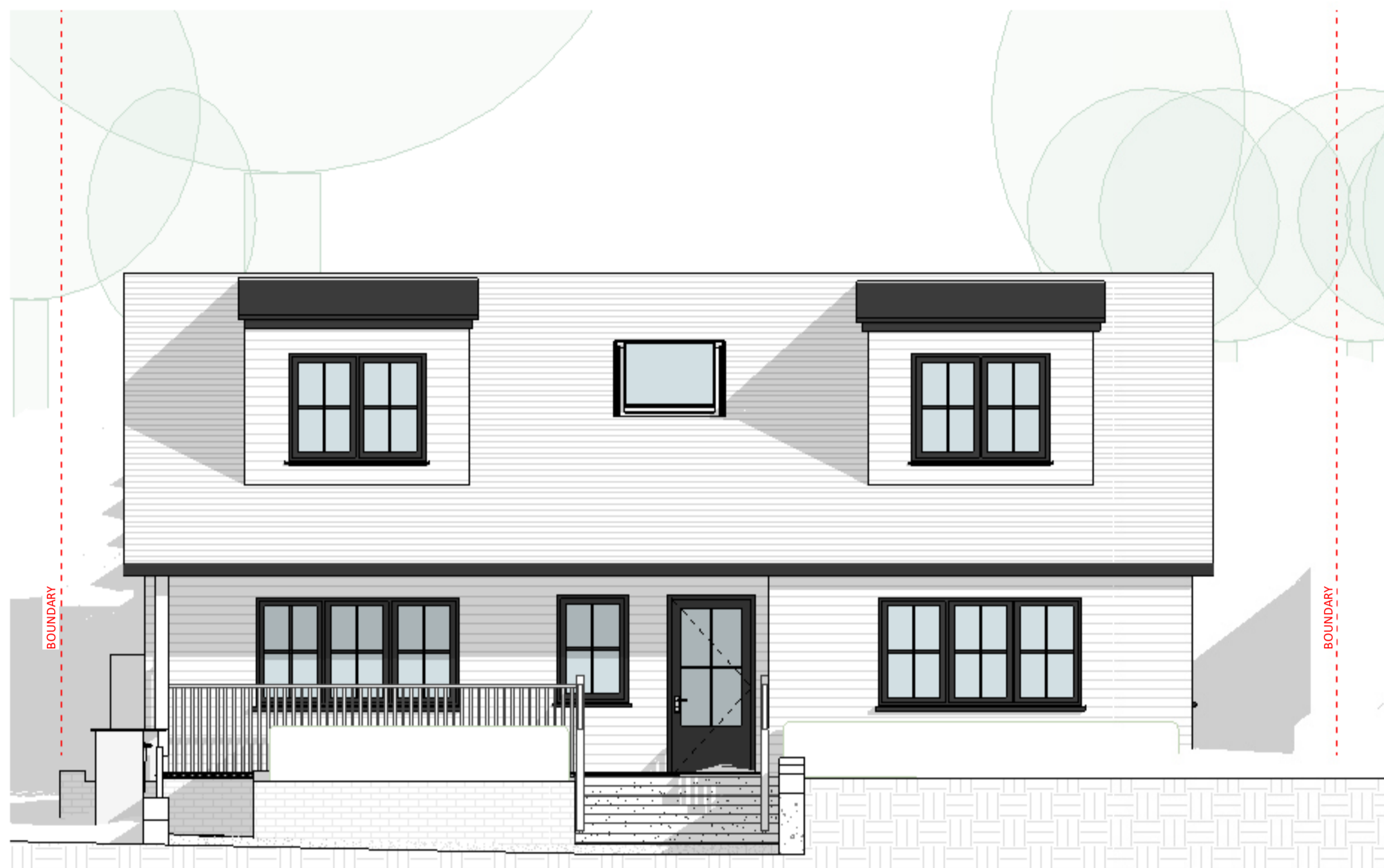
3 1.2 North West Facing Elevation 1:50