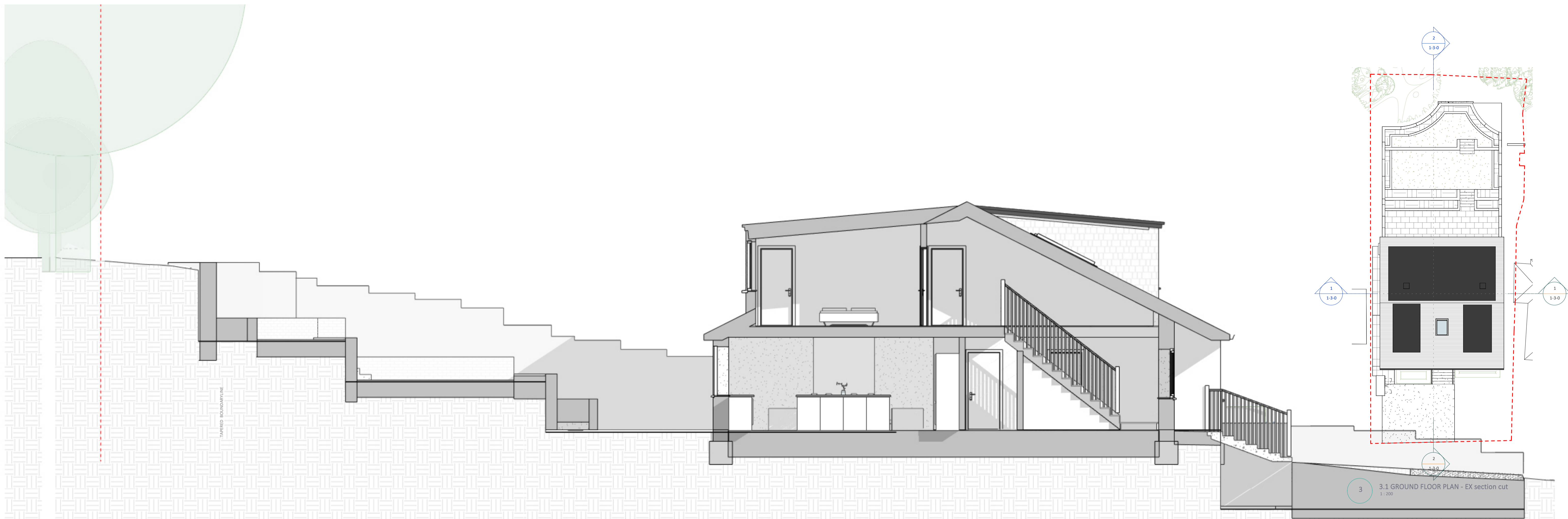
2 1.3.1 F2B Section through Site 1:50