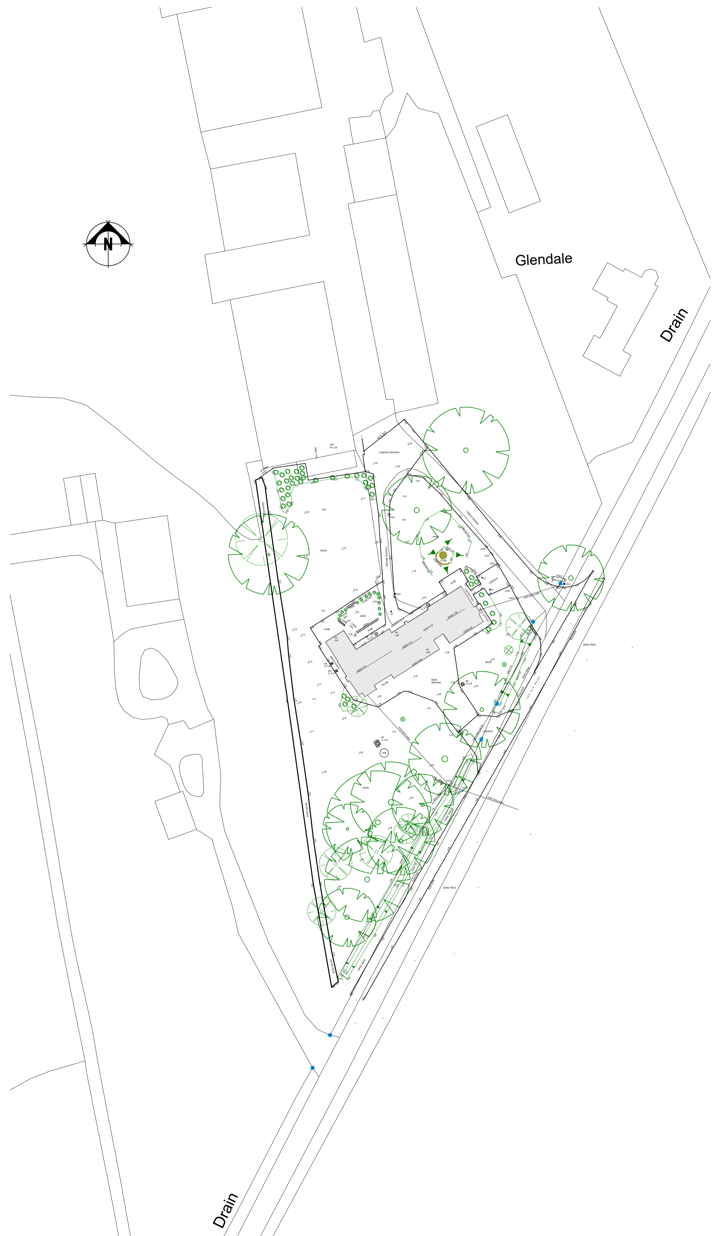
Existing Site Layout Plan (1:500)