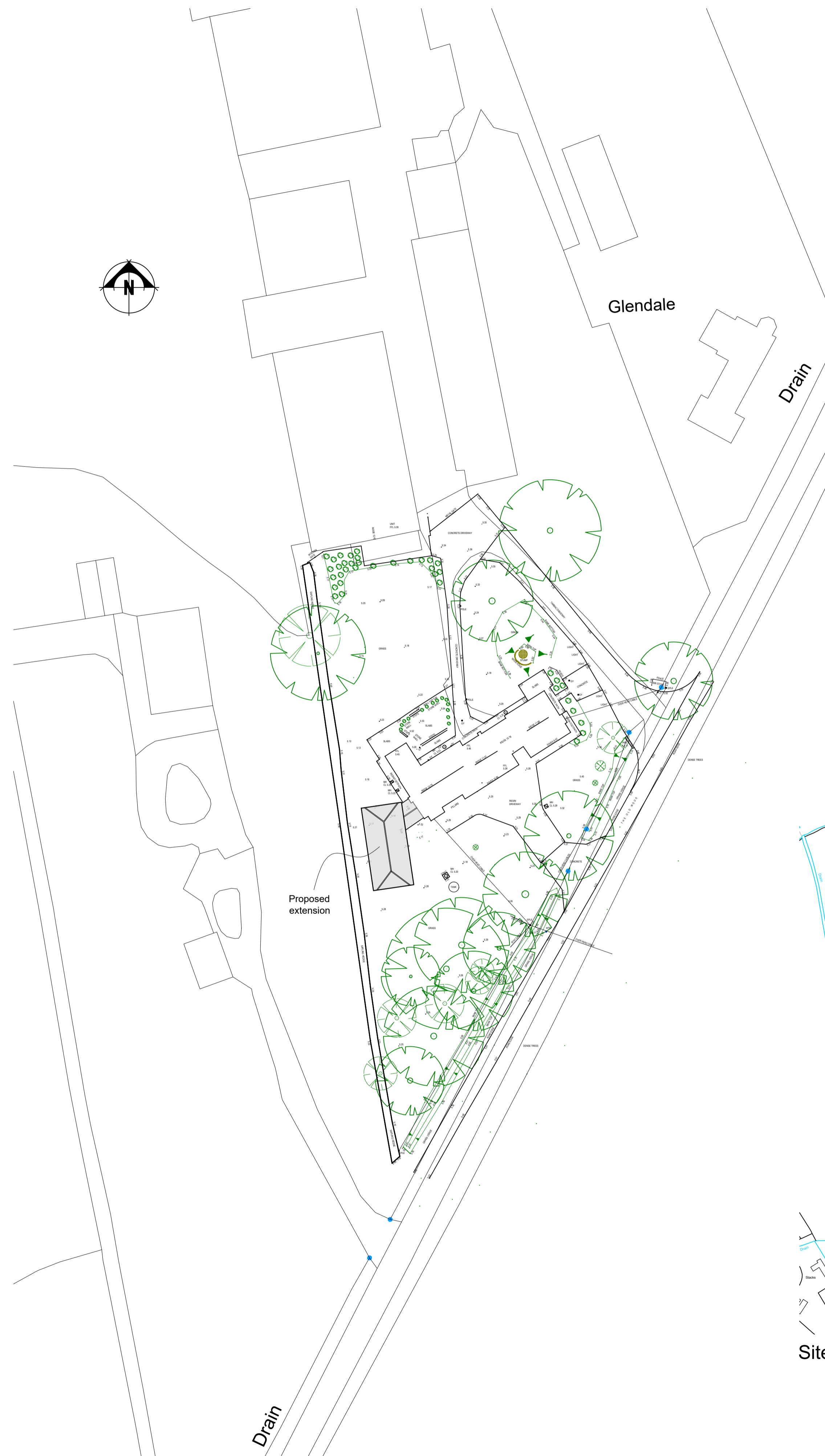
Proposed Site Layout Plan (1:500)