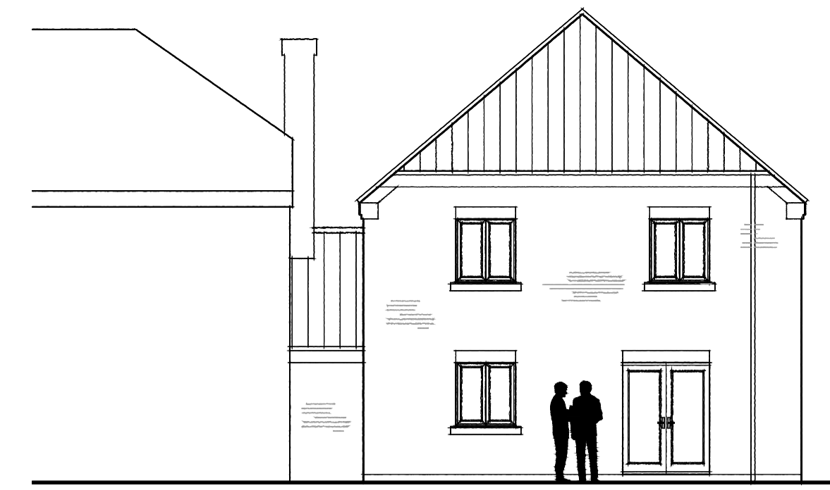
Proposed North Elevation (1:100)