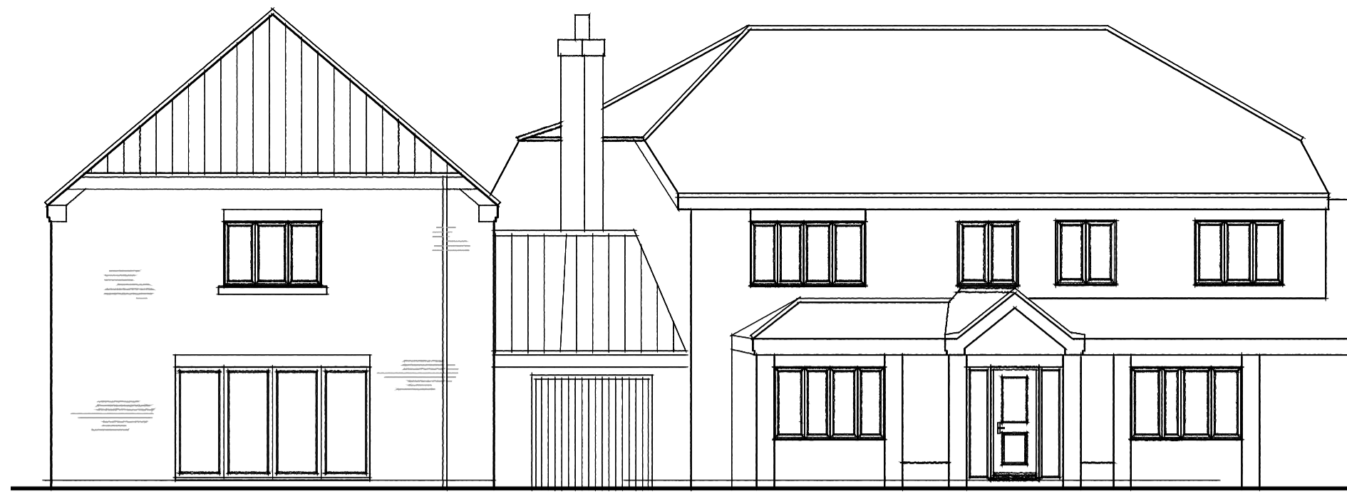
Proposed South Elevation (1:100)