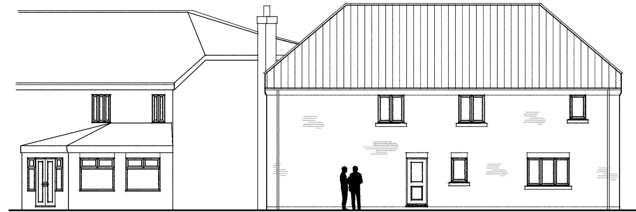
Proposed West Elevation (1:100)