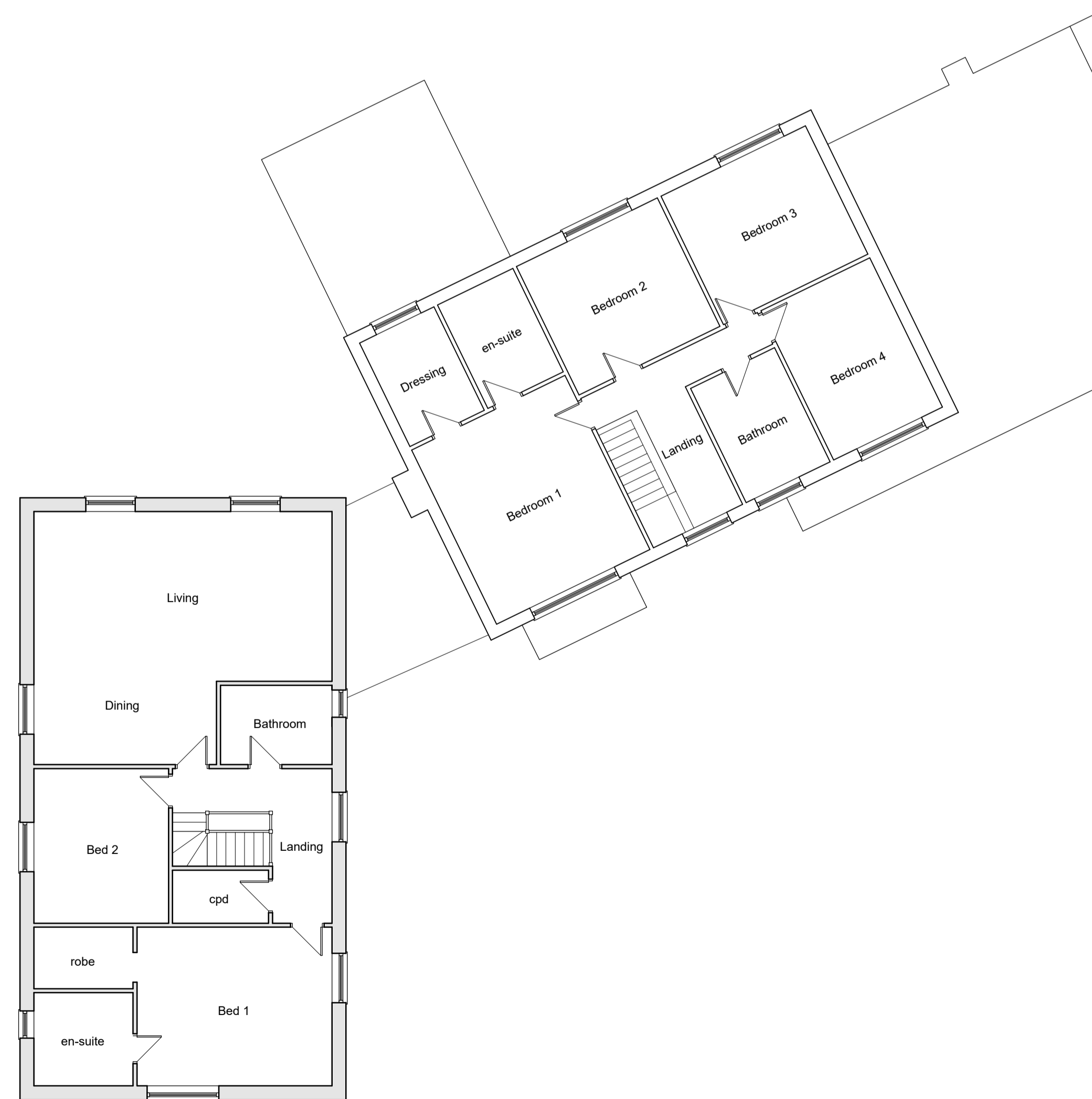
Proposed First Floor Layout Plan (1:100)

Client: Mr C. Mayo Project Title: Proposed extension, Chestnut Farm, Skellingthorpe Old Woods Dwg Title: Proposed general arrangements Scale: as shown Date: 01.24 Drawn: MC Project No: 477/CMA/1106 Drawing No: A1-03 Rev No: Do not scale this drawing. All dimensions must be checked on site. All rights reserved. No reproduction in any material form is permitted without consent.