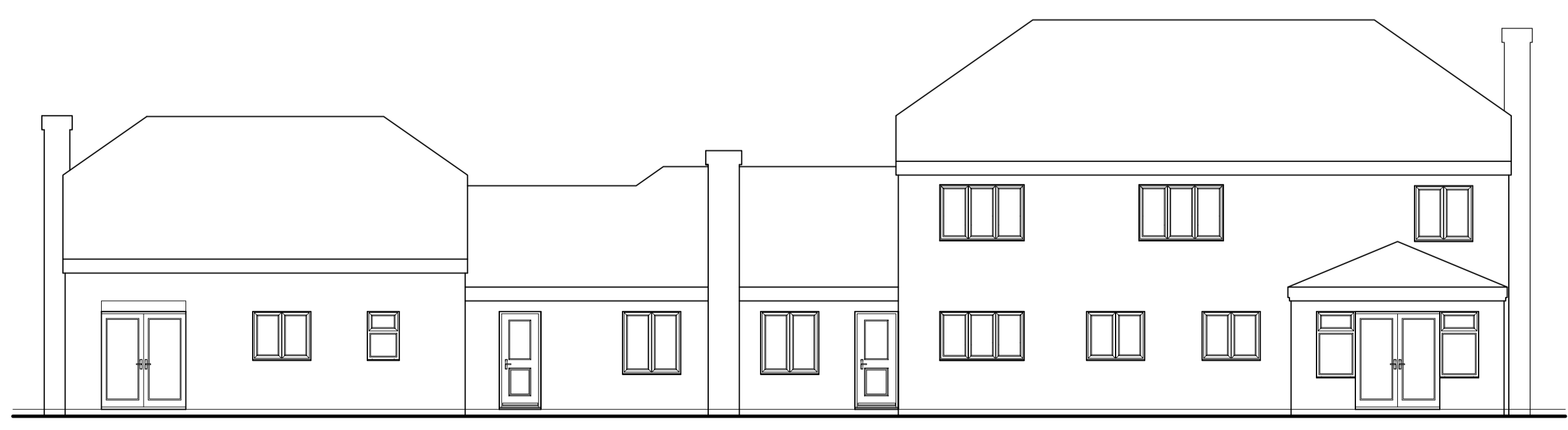
Existing North West Elevation (1:100)