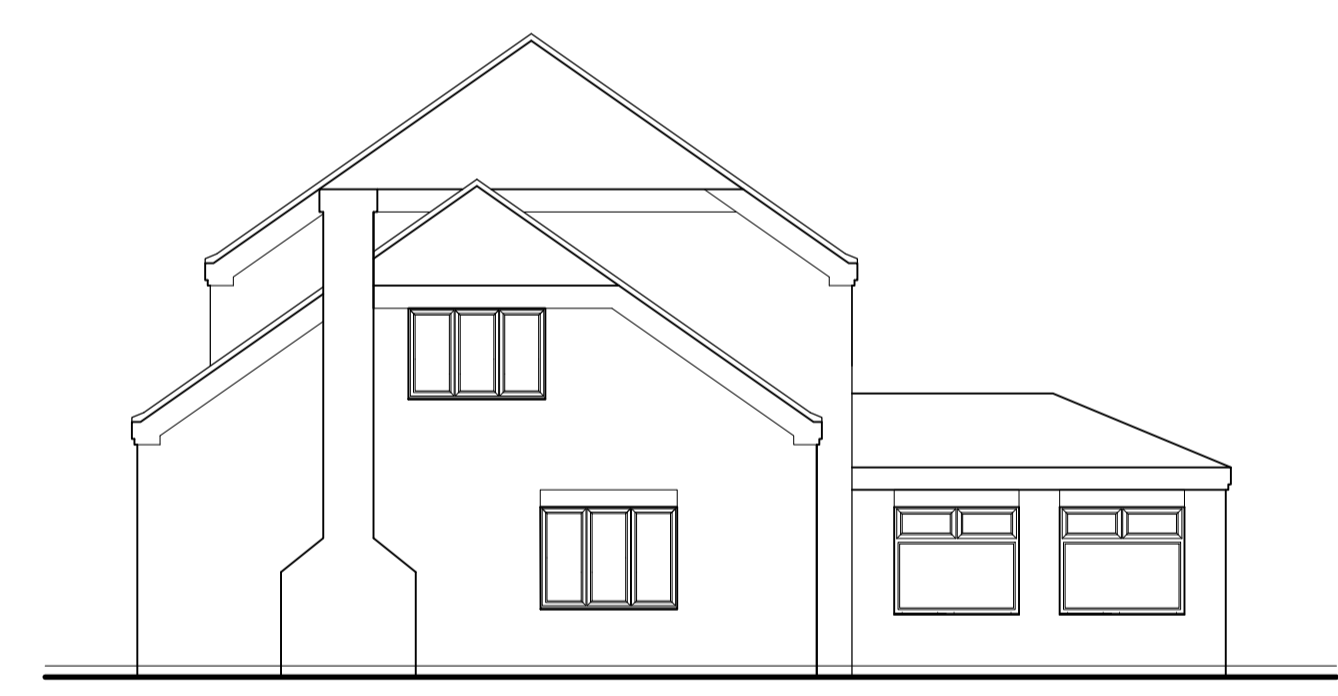
Existing South West Elevation (1:100)