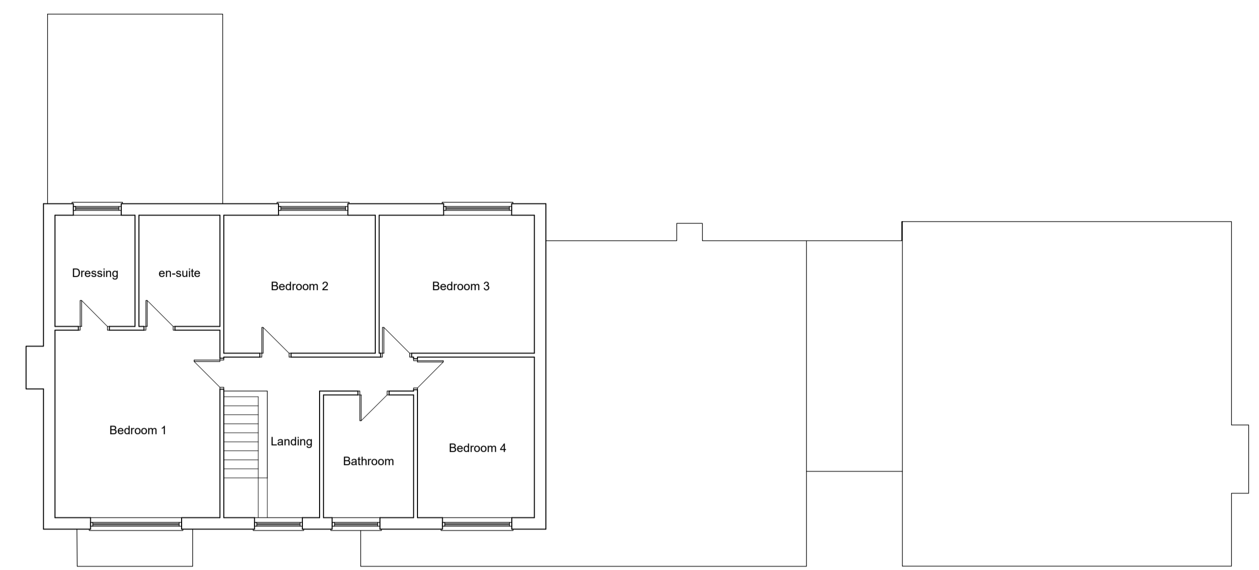
Existing First Floor Layout Plan (1:100)