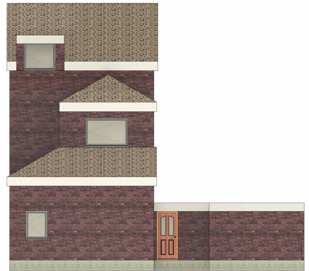
2 Elevation 4 1 : 100