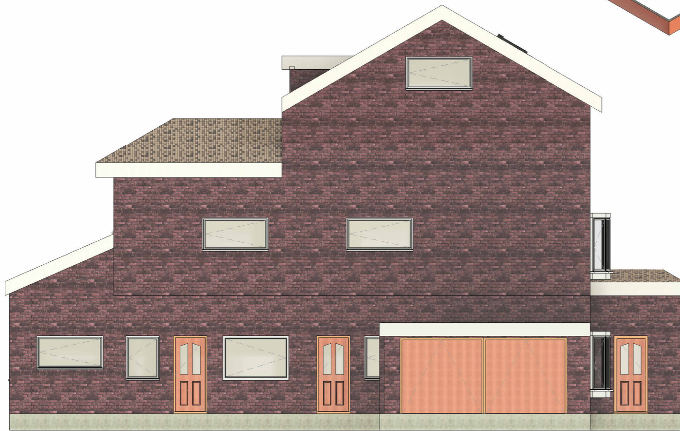
1 Elevation 3 1 : 100