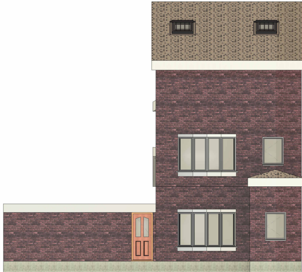
1 Elevation 1 1 : 100