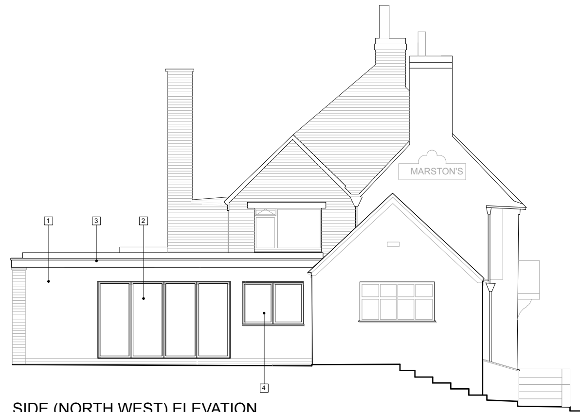
SIDE (NORTH WEST) ELEVATION