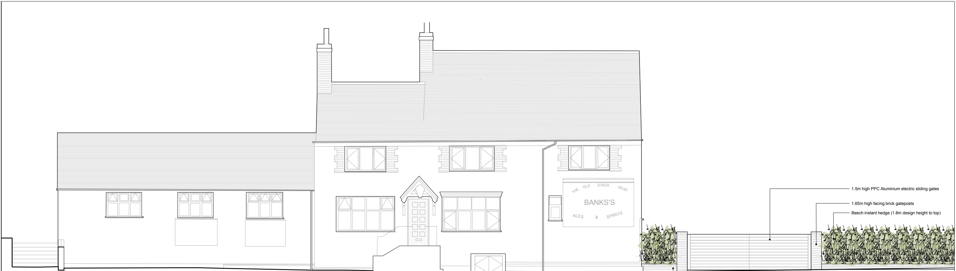
FRONT (SOUTH WEST) ELEVATION